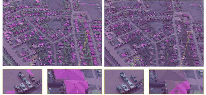
(a) No preprocessing (b) Noise and artifacts removal

We show the influence of the noise and artifacts preprocessing with SCUNet neural network for image segmentation task in Figure 1. We notice that overall, the preprocessing tends to degrade the performance of the network. The roof class is less well detected (notice however that false positives also disappear), while the masks of cars are better recovered after the preprocessing step. This experiment suggests that the segmentation results strongly rely on statistical features, such as noise and artifacts that may not be visible to the naked eye. We however underline that preprocessing pipelines may be