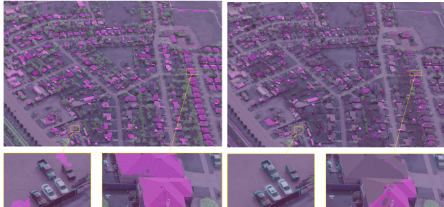
(a) No preprocessing (b) Noise and artifacts removal

We show the influence of the noise and artifacts preprocessing with SCUNet neural network for image segmentation task in Figure 1. We notice that overall, the preprocessing tends to degrade the performance of the network. The roof class is less well detected (notice however that false positives also disappear), while the masks of cars are better recovered after the preprocessing step. This experiment suggests that the segmentation results strongly rely on statistical features, such as noise and artifacts that may not be visible to the naked eye. We however underline that preprocessing pipelines may be