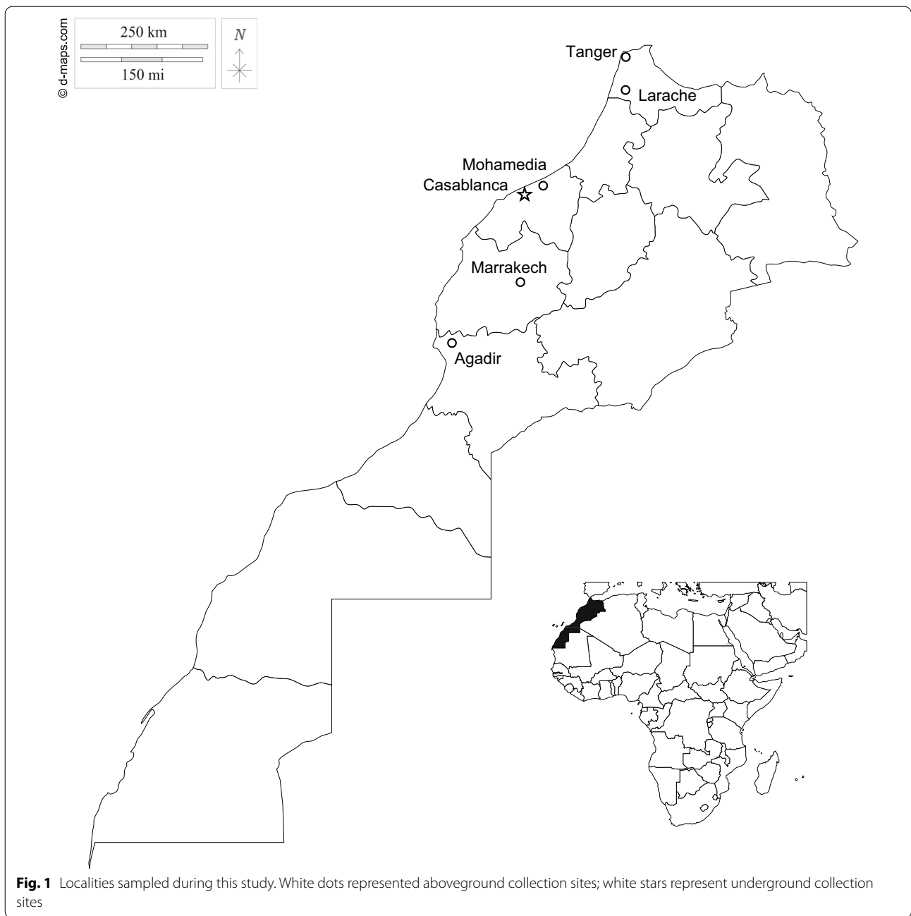
Table 1 Collection sites of Culex pipiens populations sampled in Morocco