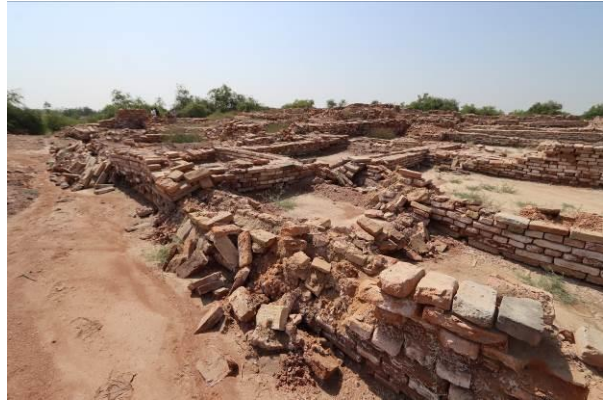
Moneer area, in a preoccupying state of conservation

As a general appreciation, it is clear that the conservation works that had been undertaken for several decades 9 were very useful. Thanks to them, many built structures are still in an acceptable state of conservation. The site remains impressive, more specifically as the conservation team immediately engaged in cleaning works making already possible for visitors to access the main areas (SD & DK, VS in progress 10 ).