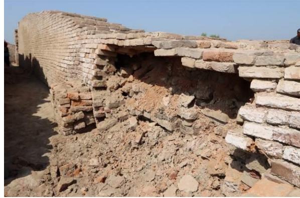
Concrete layer between the two last brick courses at HR

Finally, what has been most destructive at Moenjodaro last August is similar to what had been described by Hughes in his 1994 report (at 1.2). . “Some collapses may have been triggered by surcharge pressures of soil behind (the extra weight and volume). Actually, in many instances, walls have been pushed by the backfilling needed to get rooms at different levels (often above street level) This is generally connected to the issue of drainage more specifically when looking at it from the beginning, the top of the walls, at times very large and being able to collect huge amounts of water.