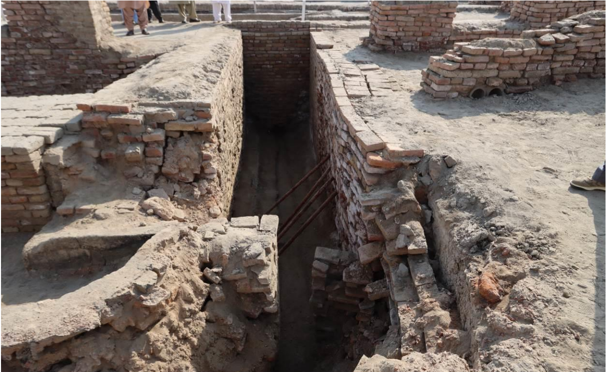
Instability of retaining wall at the southern side of canal from bath in SD area.

Most of the sensitive situations of walls are linked to issues related to drainage and presence of salts. Thus, in addition to maintenance / repair needs (wall capping and underpinning), those threats should also be addressed “locally” to avoid repetition of similar phenomenon in the future at the same places.