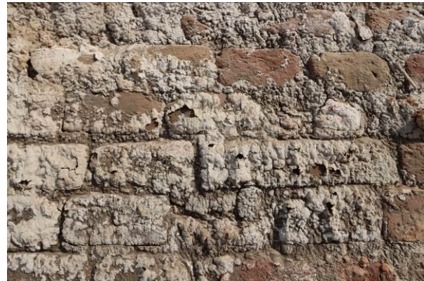
Use of mud slurry to form a salt crust against bricks

These measures are fully part of what is being done at the site today by the conservation team and on regular basis. Though salt presence and related decays appear to be still very much present. One of the hypotheses for this is that the efforts made up to now do not insist enough on salt removal. The removal was done, but probably insufficiently. As an example, it was witnessed at the beginning of the mission that the undergoing brushing of salty sacrificial mud slurry is not linked to removal from the site. That led to suggest that a system would be set so that the slurry dust would be collected and dropped outside the archaeological site perimeter. This measure was immediately adopted by the director of Moenjodaro Conservation Office (MCO).