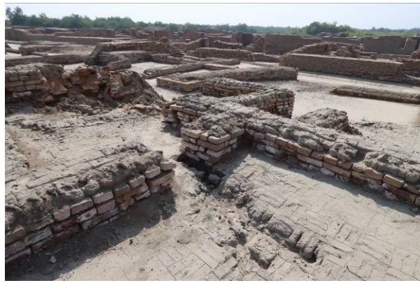
Gully type of erosion of drainage system at DK area

While undertaking the first overall assessment, the main circumstances and processes of decay were studied. Overall, there seem to be 3 main causes of decay: