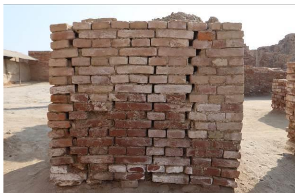
Two column types of wall (L and DKG areas) illustrating well the typical collapse process starting from the base