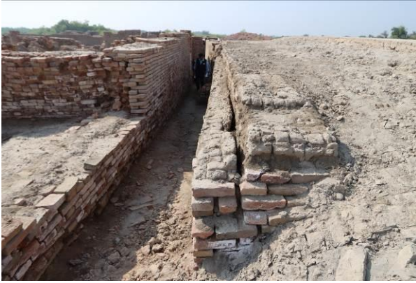
Typical wall deformation with crack at DK Area