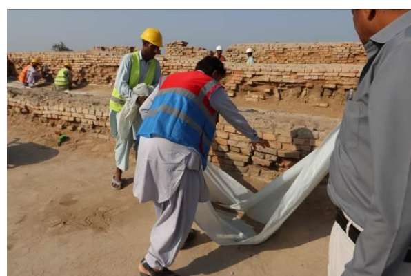
Removal of salty mud slurry, SD Area, using geotextile to collect and transport dust away from the site, 22.11

Hopefully this will contribute to a gradual diminution of salt content at the site. One of the hypothesis being that the structural fabrics are not only affected by the salt originating from the water table, but also from salt present on the ground level which can be dissolved during rains with potentially this salty rain water to penetrate the flooring and then migrates towards