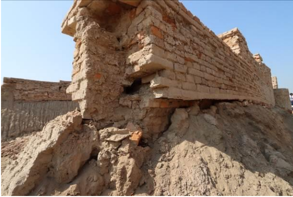
Damp proof course at DKG partly efficient