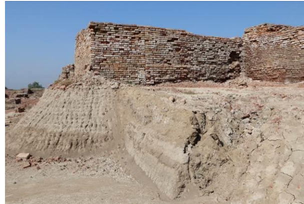
Gaps left by eroded sand under mud brick floor SV area Pushta protection affected by water infiltration HR area

Besides that, this system is allowing water infiltration through the bricks and then through the layer of sand down to the original fabric. The resulting issue is that this humidity is like trapped under this layer of sand with the only potential of being evaporated through wall structures, at times above ground level, but also when structures are forming terraces (more specifically the case of the stupa zone, but not only), and as such, increasing the potential of crystallisation of salts on their surfaces (see next chapter).