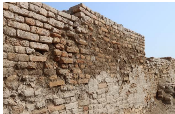
Traces of high humidity content under floor SD area Traces of high humidity on retaining wall. SD area