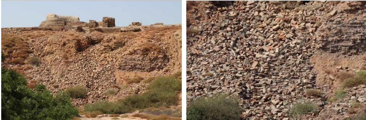
On the eastern side of the citadel area, the huge flows of water collected by the upper platform have revealed some structural elements which could be the original steps to the stupa.

An exception given to the above proposal could be the structure observed at the eastern end of the citadel where what could have been the steps to the Buddhist stupa may have appeared. That might represent a major plus for the site and, as such, might be given consideration if a team could be mobilized to undertake a first cleaning exercise whose result might lead to programming a fully structured archaeological exploration / survey.