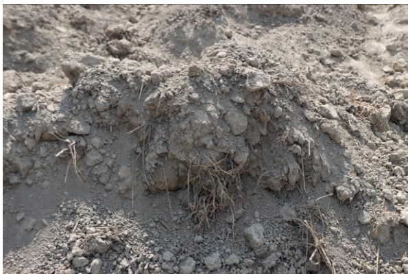
Soil just delivered at DKG Area with high humus content