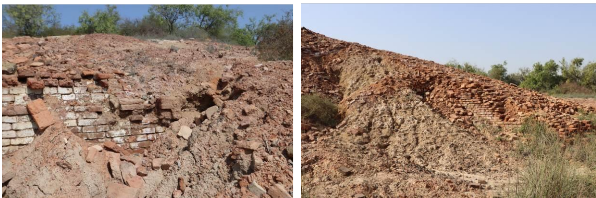
Two examples of newly revealed structures that can be seen in various places at the site

As a result, there are numerous places where structures have been revealed and are now quite visible. Some appear to have become at risk when new monsoon seasons will be coming. That would be quite a loss, knowing the potential that those still buried structures represents, as being fully original while those now visible at most of the areas (those open to the public) have been restored several times. However today, there are some difficulties to differentiate the original from the new.