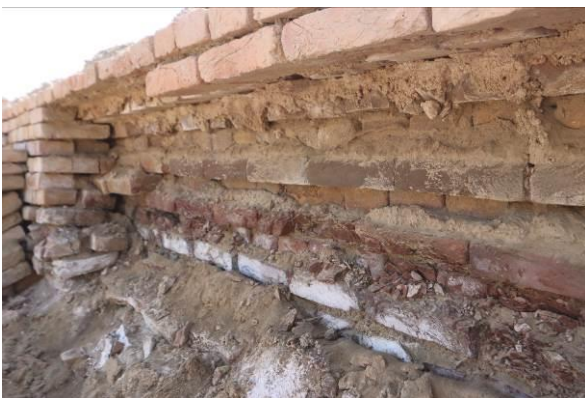
Salt inside the wall visible after collapse, HR Area

Another potential factor is that of the presence of gaps inside the walls, whether they be inside the original fabric or located at the interface of the old fabric and that of the restoration works. That would explain the presence of huge quantities of salts inside the walls, very visible when the restored fabric has collapsed. That calls for specific attention when restoring to make sure that gaps are fully filled and also that if the old and “new” fabric are not well connected, cracks can appear which then represent a double threat that of this high presence of salts in addition to the structural weakness. When structures are weakened at the wall base (elevation side exposed to water flows or stagnation, or simply damp) they often develop cracks that drive rainwater down. Processes of dissolution of salt and migration again inside the structural fabric are most probable, a kind of vicious circle which constantly increase the problem.