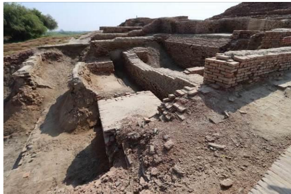
North side of citadel showing bended walls