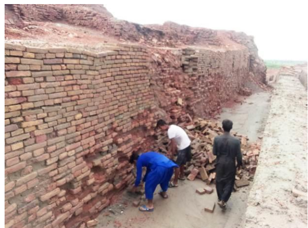
Cleaning of debris in SD (Citadel) area immediately after rains

Thanks to the good organization of the mission by the conservation team at Mohenjodaro, all areas of the site were visited and examined, allowing to take stock of the level of destruction and first measures already implemented. A visit to the protective dykes and spurs was also