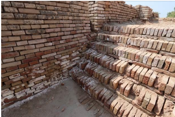
Presence of salts at DK Area