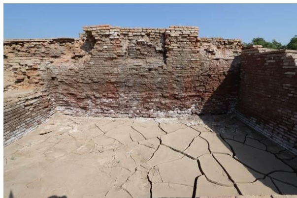
Failure of drainage system at SD area © N. A. Sangha: Temple at HR area, with traces of high water level