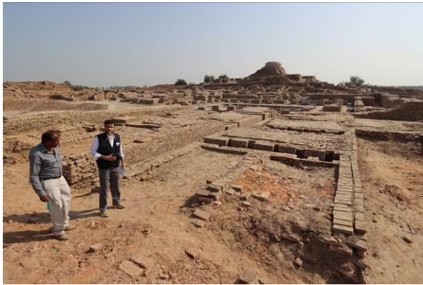
SD Area, the best preserved

organized, and additional reports and documents available in the Office library were taken into account. The conservation laboratory was also visited with presentation of all testing procedures.