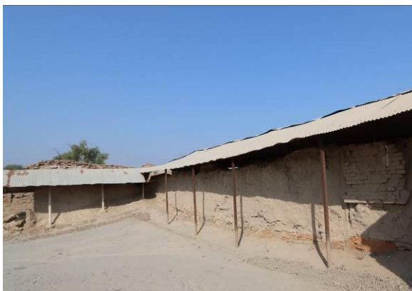
Overall protected wall (fallen part at the left)

In DKG area, part of a mud brick wall (probably originating from the more recent period – Buddhist) has fallen down. This wall is protected by an iron sheet roof, making it clear that the collapse originates from insufficient drainage at its base, possibly linked with accumulation of sand (from wind) and debris in the narrow passage located at its western side.