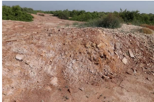
Archaeological debris pits are an other source of salts

Another potential factor is that of the presence of gaps inside the walls, whether they be inside the original fabric or located at the interface of the old fabric and that of the restoration works. That would explain the presence of huge quantities of salts inside the walls, very visible when the restored fabric has collapsed. That calls for specific attention when restoring to make sure that gaps are fully filled and also that if the old and “new” fabric are not well connected, cracks can appear which then represent a double threat that of this high presence of salts in addition to the structural weakness. When structures are weakened at the wall base (elevation side exposed to water flows or stagnation, or simply damp) they often develop cracks that drive rainwater down. Processes of dissolution of salt and migration again inside the structural fabric are most probable, a kind of vicious circle which constantly increase the problem.