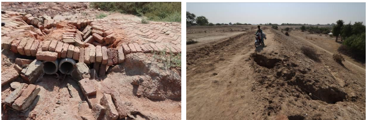
Burnt bricks paths have suffered but are easy to repair The roads at the top of the dikes have also suffered