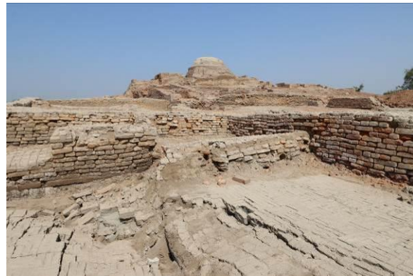
Pressure against walls by backfilling of platforms / rooms floors, DKG area (left) and SD area (right)