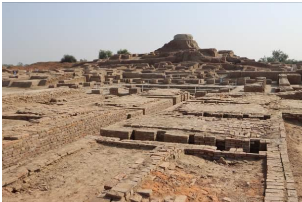
Stupa from L area

In fact, this could be the result of the presence of humidity inside the core of the citadel under the stupa, made more than possible by the flooring system (bricks on a sand layer) installed also at the upper platform which represents a huge water collection area while being very much exposed to rains. And two months after the heavy rains of August, many of the walls, including on the south side (better exposed to sun) were showing darker zones indicating the presence of damp.