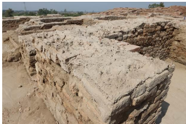
Same type of soil applied on wall capping at SD Area

This calls for launching a process for re-installing a more systematic process for the quality of the materials being used at Moenjodaro, both for the earth and for the burnt bricks: