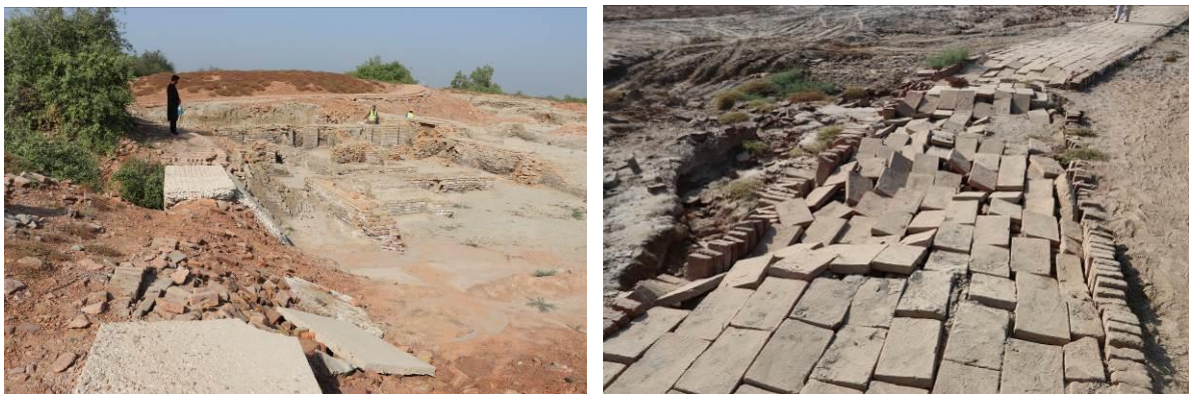
Concrete slabs of various sizes have been affected giving an idea of the violence of the runoffs

The visitor's paths that have been built in Moenjodaro either within the excavated areas or between them have also been subject to destruction. These have occurred mostly where gullies have evolved substantially, but also in most of the places where runoff is collected. Even where some specific assets (pipes) had been installed, many of them proved to be insufficient to support the intensity of the flows. Even some very heavy concrete slabs have been moved some of them substantially.