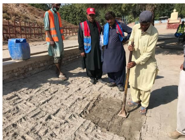
Unsuccessful test on “bricks on sand” floor.