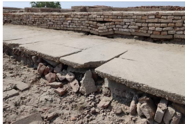
Slopes of pathway led to self and wall damages (L area)

Finally, an important issue has also been observed, representing an additional opportunity for scientific research. As a result of the heavy rains, erosion gullies have developed deeply on some of the many untouched archaeological mounds. This has resulted in revealing some unknown archaeological assets (see pictures hereunder). Some of those appear to have specific interest (e.g. east side of the citadel) as a new archaeological corpus. It will also be important to analyze some situations that may require preventive measures (avoiding degradations in case of new heavy rains).