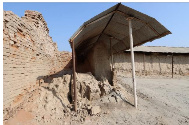
The fallen part (south west end)