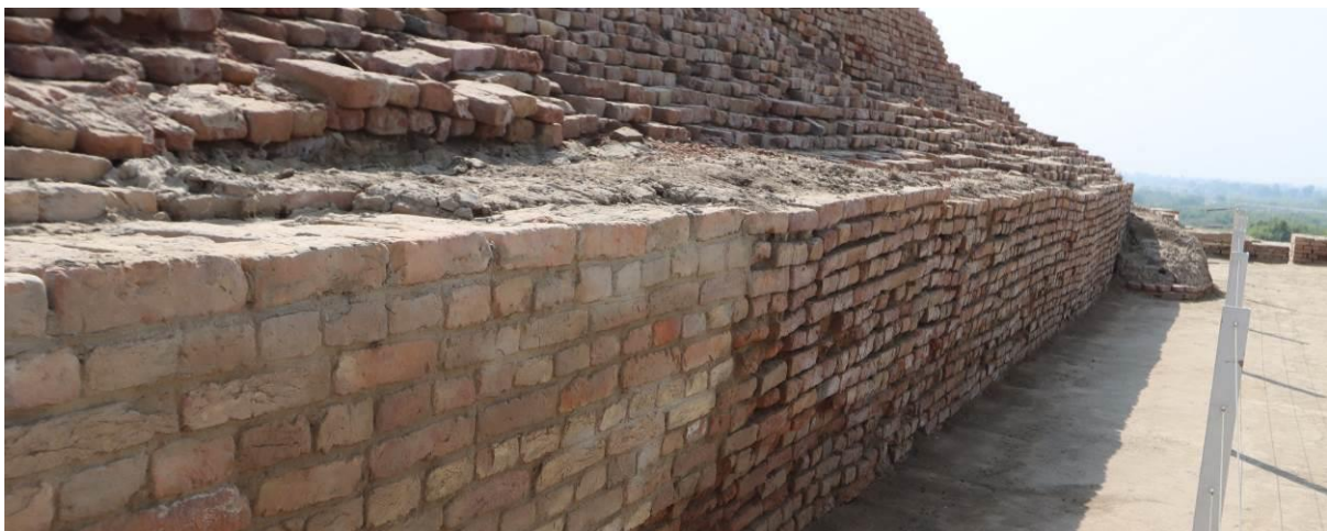
The retaining wall at the base of the stupa (west side) is clearly leaning out

Another observation is that the walls at the base of the stupa appear to be leaning out. This is also a point of attention that needs to be tackled during next mission, taking as a base the restoration reports that could give some indications on what has been done there (or not) and when? Though, such a question will probably need a long period of observation / monitoring to have a precise idea of whether there is a movement or not. This will not prevent a reflection on what could be the reasons (potential infiltration of water above this wall) and to install preventative measures.