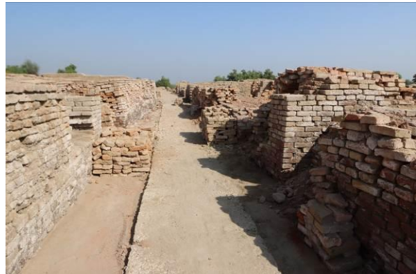
HR area, concrete slab path blocking runoff

The revision of these paths is a huge work in itself and thus requires a specific study. To get an overall idea of the situation (quantitative and qualitative) to be able to prepare that, it has been agreed to :