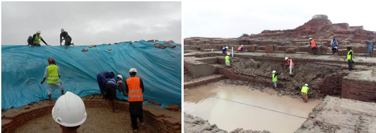
Left, installing tarpaulin on top of the stupa; Right, the Great bath when flooded

However, what appeared to have been sufficient in terms of monsoon preparedness until this year was unfortunately only partially efficient under such exceptional rainfall. Very concerned by the situation, the Antiquities staffs were mobilized to do their best to protect what could be, even if their own houses were being flooded by that time. It is an effort important to acknowledge. That included setting of tarpaulin on the top of the stupa, pumping water (even at night) in flooded rooms, repair of drainage canals, etc.