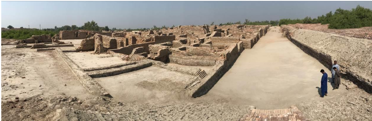
Main street at DK area. Water collected is blocked at its south end thus entering the old city fabric

At a larger scale, it was noted that the overall drainage system sometimes involves collection of rainwater from large areas and instead of driving the run-off far from the archaeological remains, drives it inside narrow streets. This is the case more specifically at DK area where the large street at the eastern side drives water towards south but as it is blocked by archaeological debris mounds turns right inside the old city fabric, to finally be drained towards the western canal. But there are many other similar situations where high run-off is guided towards archaeological remains instead of “to safe discharge areas”.