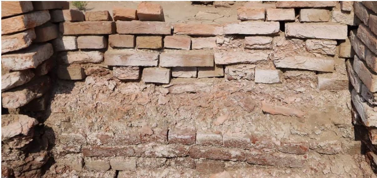
The variety of quality of burnt bricks is very visible on this wall at DKG area, very good state at the base, almost fully disintegrated in the middle, acceptable at the top

bricks is particularly illustrating that with in the presence of salts bricks in the same course can be in perfect state while another besides it is almost fully disintegrated. The issue of soil selection for mud bricks making and mortar, also seems to be somehow underestimated, as there is, probably for several years now (as there are signs in the eroded wall capping) the use of soils that contain quite a huge amount of vegetal matters (plant roots). The loads of soils at the entry of DKG Area appear to be in that line which is a bit surprising when knowing that there is a laboratory and a lab operator which could check the soils already at the quarry level.