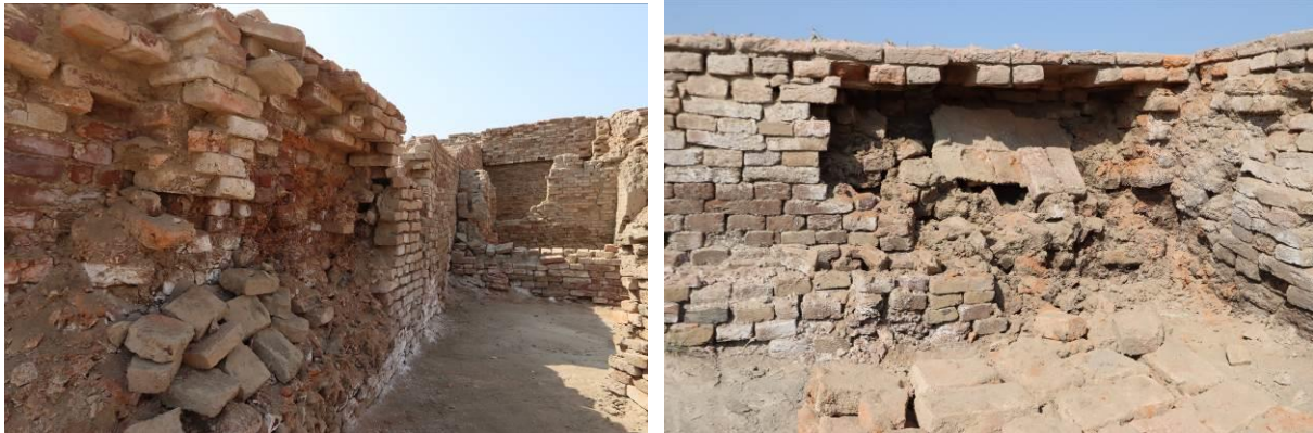
Wall collapses where salt attack has played a strong role at DKG (left) and HR (right) areas.

Though this typical phenomenon as described above is developing in many different ways and is also much favored when the burnt bricks at the wall bases are already prone to salt degradation that has a serious effect on their bearing capacity.