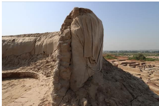
Picture showing fallen part and protective geotextile

Another observation is that the walls at the base of the stupa appear to be leaning out. This is also a point of attention that needs to be tackled during next mission, taking as a base the restoration reports that could give some indications on what has been done there (or not) and when? Though, such a question will probably need a long period of observation / monitoring to have a precise idea of whether there is a movement or not. This will not prevent a reflection on what could be the reasons (potential infiltration of water above this wall) and to install preventative measures.