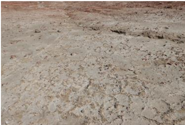
Flooring with high salt content, HR Area

the wall through the capillarity process. That can explain the high salt content at some places.