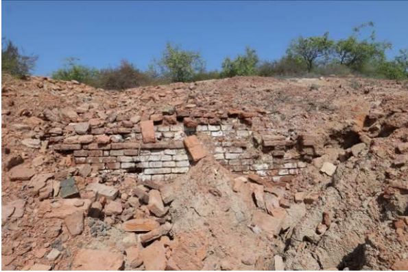
Probably a portion of city wall (near HR area)