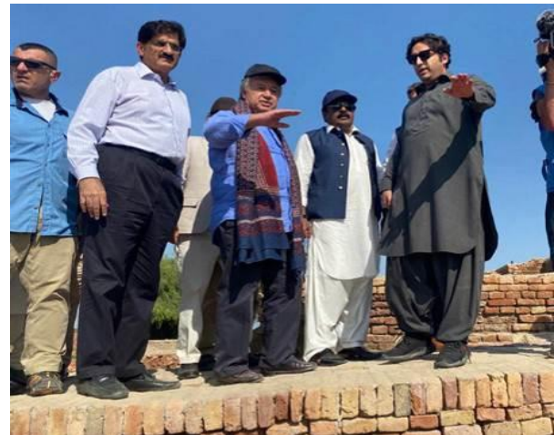
FM Bilawal briefed Guterres on the damages conceded by Mohenjo Daro due to historic rains and floods.

The goal set by UNSG is clear and the UNESCO mission therefore was not only to assess current damages, but also identify the potential variety of levels of destruction at the various areas that the site comprises (7), to increase resilience in preserving the site.