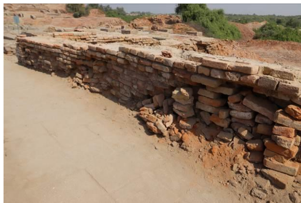
Concrete path with slope driving run-off to a wall. L area