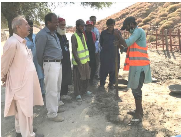
Successful repair of a gully at the entry of SD area

Tests of this technique have been undertaken on Tuesday 25: