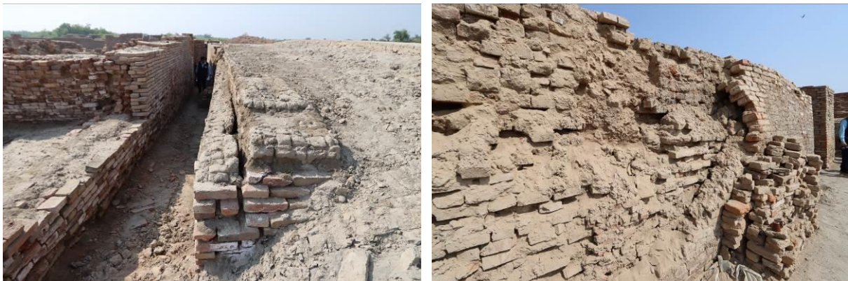
Two stages of the process of separation between the new and the old parts of walls, DKG area.

Another factor which appears to favor wall collapses is that most of the restored parts of the walls have little connection to the original parts. This is something very common at many archaeological sites around the world as there is a global reluctance to touch the original fabric either through removing parts of it to make sure that there is proper bonding between the old and the new, or to install connecting assets (e.g. tie rods). In such cases, the weakening of the external part of the wall base has a much quicker effect than it would be on a full homogeneous (well bonded) wall as the surface concerned is far less.