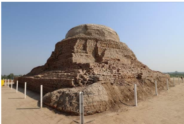
Stupa from south west side

Though time was too short during the mission to make a serious condition survey of this important heritage asset, a specific condition survey of this structure will be undertaken during the second UNESCO expert mission that will require organizing easier access (ladders or scaffolding) so as to be able to check the condition of the part under the geotextile.