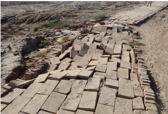
Damaged pathway between SD and L areas

A specific additional point is the visitor's pathways which at some places were seriously affected by the flows of water. Many of the tubes installed at water flows levels have proven to be under-equipped for the heavy flows. Besides, some paths have slopes leaning towards archaeological remains or tend to block water flows, situations that have already led to weakening the walls basis that do need to be revised.