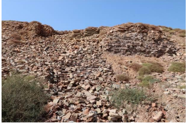
At the east side of the citadel: traces of a staircase?