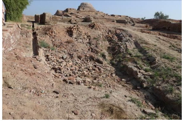
Undermining of wall by run-off, SD area Ancient drainage systems damaged, south of SD area

One should note that the system used at Moenjodaro for the treatment of the floors (sundried mud bricks laid on a layer of sand) though giving satisfaction for draining water flows placed a negative impact when run-off developed large gullies which manage to fully erode the surface bricks, with very little resistance of the sand layer and acceleration of the erosion process.