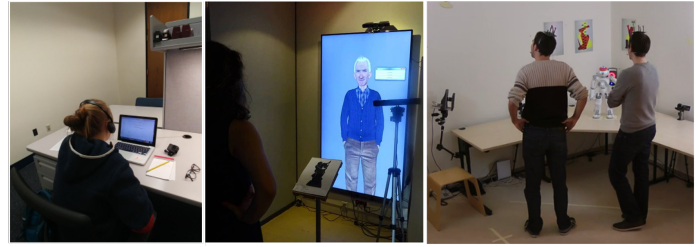
Fig. 1. Examples of disembodied [34] and embodied (HAI [35], HRI [15]) interaction scenarios.

This review will serve as a guide for researchers interested in the topic of engagement to acquire a holistic understanding of the concept. Specifically, the emphasis on the contextual factors of engagement, and how engagement was defined and detected across different contexts in the literature will inform context-aware artificially intelligent systems. Consequently, this will allow the design of human-machine interactions with increased usability, accuracy, and efficiency in real-time settings, leading to improved user experience.