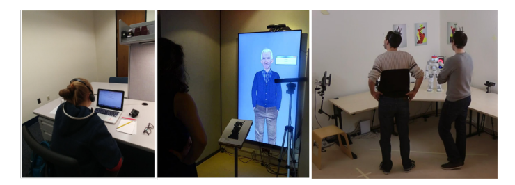
Fig. 1. Examples of disembodied [34] and embodied (HAI [35], HRI [15]) interaction scenarios.

This review will serve as a guide for researchers interested in the topic of engagement to acquire a holistic understanding of the concept. Specifically, the emphasis on the contextual factors of engagement, and how engagement was defined and detected across different contexts in the literature will inform context-aware artificially intelligent systems. Consequently, this will allow the design of human-machine interactions with increased usability, accuracy, and efficiency in real-time settings, leading to improved user experience.