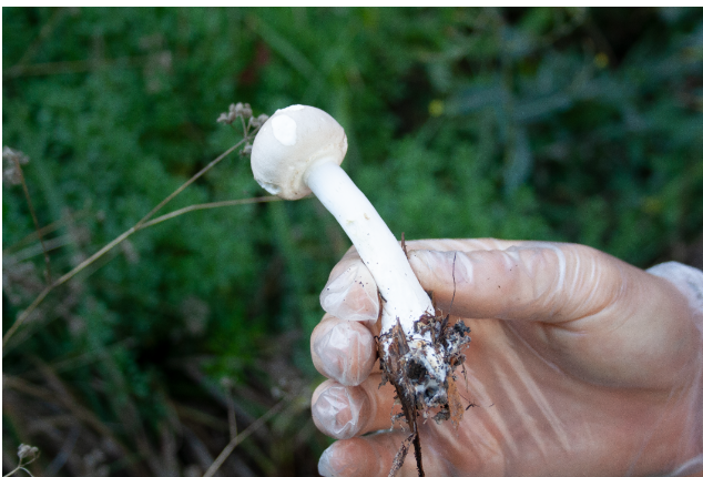
Figure 1. Agaricus arvensis , mushroom from which we are currently cloning the mycelium.

The core of the project is the creation of an interactive sound installation in co-creation with a network of mycelium whose emergence, development and life conditions will have been organized by humans.