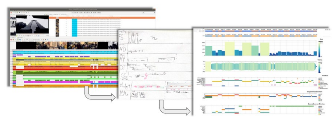
Figure 1: Advene is used as a generic tool to manipulate data. Based on the experience, a dedicated web-based visualisation is designed and implemented.

This paper discusses interdisciplinary collaborative practices based on the AdA project (meaning "Affektrhetoriken des Audiovisuellen" <a href="https://projectada.github.io/">https://projectada.github.io/</a>) in which institutionally situated research groups from computational sciences and film studies developed approaches for the analysis of the temporal dynamics of audiovisual expressivity by bringing together a theoretically informed methodology of film analysis and computational video analysis and semantic video annotation. A corpus analysis of audiovisual rhetorics on the financial crisis (2007–) required the groundwork for a collaborative annotation process and resulted in the structured vocabulary of the AdA Ontology (Bakels et al. 2020). The annotation process was carried out with the open-source-software Advene (Aubert et al. 2005, <a href="https://www.advene.org/">https://www.advene.org/</a>). In an earlier publication (Aubert et al. 2021), we already presented how co-building a Digital Humanities tool could be seen as instrumental genesis. In it we concentrated on the iterative development of a visualisation framework (see figure 1) to highlight the need for a common language and for the consideration of time needed for collaboration.