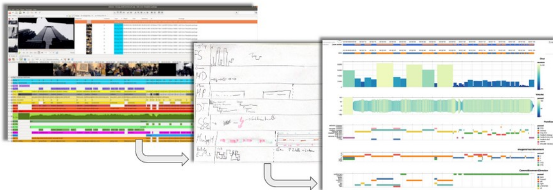
Figure 1: Advene is used as a generic tool to manipulate data. Based on the experience, a dedicated web-based visualisation is designed and implemented.

This paper discusses interdisciplinary collaborative practices based on the AdA project (meaning “Affektrhetoriken des Audiovisuellen” https://projectada.github.io/ ) in which institutionally situated research groups from computational sciences and film studies developed approaches for the analysis of the temporal dynamics of audiovisual expressivity by bringing together a theoretically informed methodology of film analysis and computational video analysis and semantic video annotation. A corpus analysis of audiovisual rhetorics on the financial crisis (2007–) required the groundwork for a collaborative annotation process and resulted in the structured vocabulary of the AdA Ontology (Bakels et al. 2020). The annotation process was carried out with the open-source-software Advene (Aubert et al. 2005, https://www.advene.org/ ). In an earlier publication (Aubert et al. 2021), we already presented how co-building a Digital Humanities tool could be seen as instrumental genesis. In it we concentrated on the iterative development of a visualisation framework (see figure 1) to highlight the need for a common language and for the consideration of time needed for collaboration.