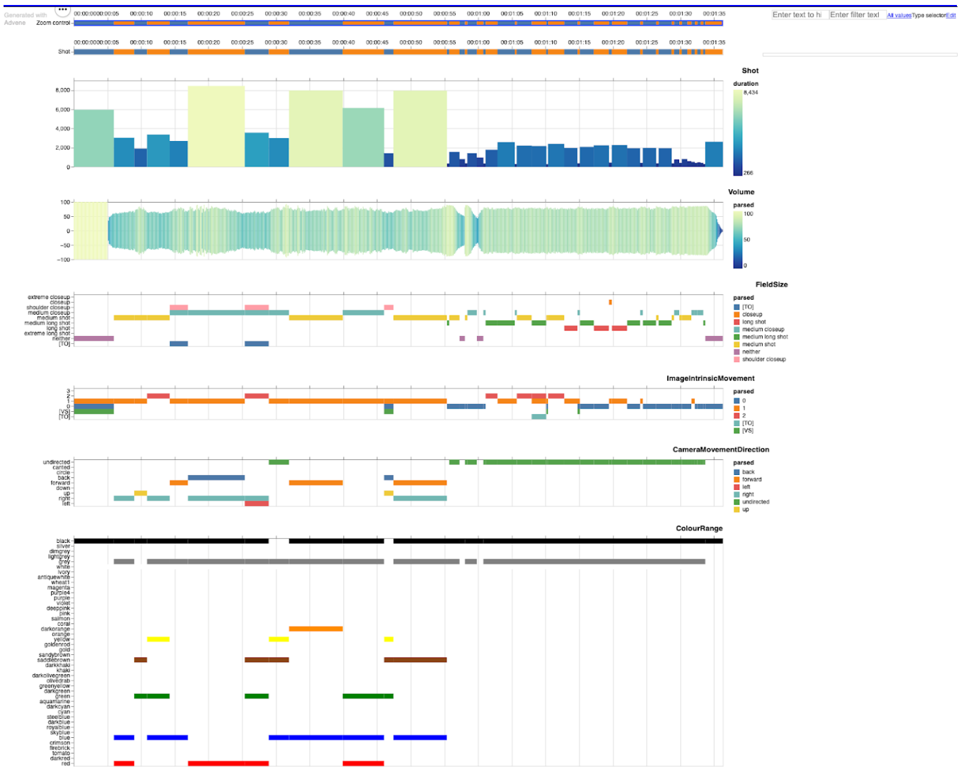
Fig. 3: New web-based version of the timeline for exploration and presentation