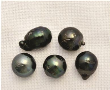
e) surface defects