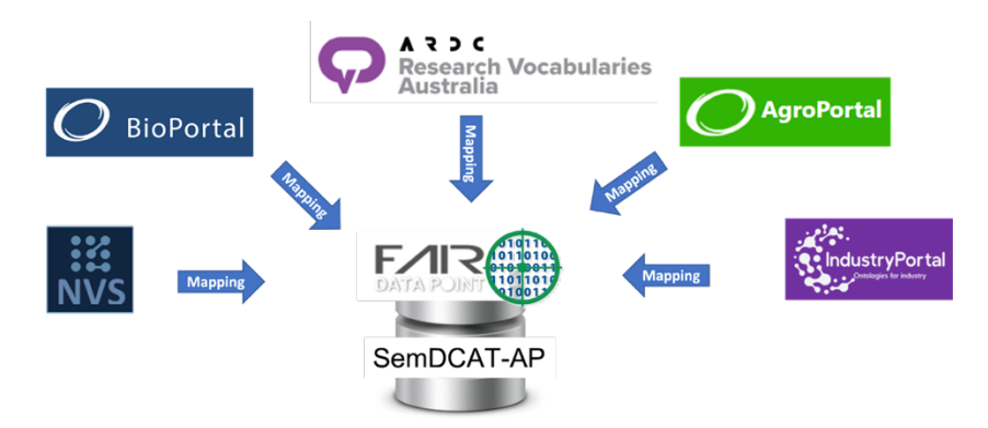
Figure 4. FAIRcat: harvest semantic artefact catalogues content and map them to a common profile.

the side of repository providers. The idea of FAIRcat is depicted in Figure 4. Semantic artefact catalogues were harvested for their items metadata. Using mappings, they are converted into the SemanticDCAT-AP and stored into a FAIR Data Point, the FAIRsFAIR Reference FAIR Data Point in our case.<sup>15</sup>