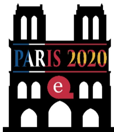
Figure 1. The logo from the meeting “41st Meeting of the Electrochemistry Group of the Spanish Royal Society of Chemistry and the 1st French–Spanish Atelier/Workshop on Electrochemistry”, Current Trends in Electrochemistry.