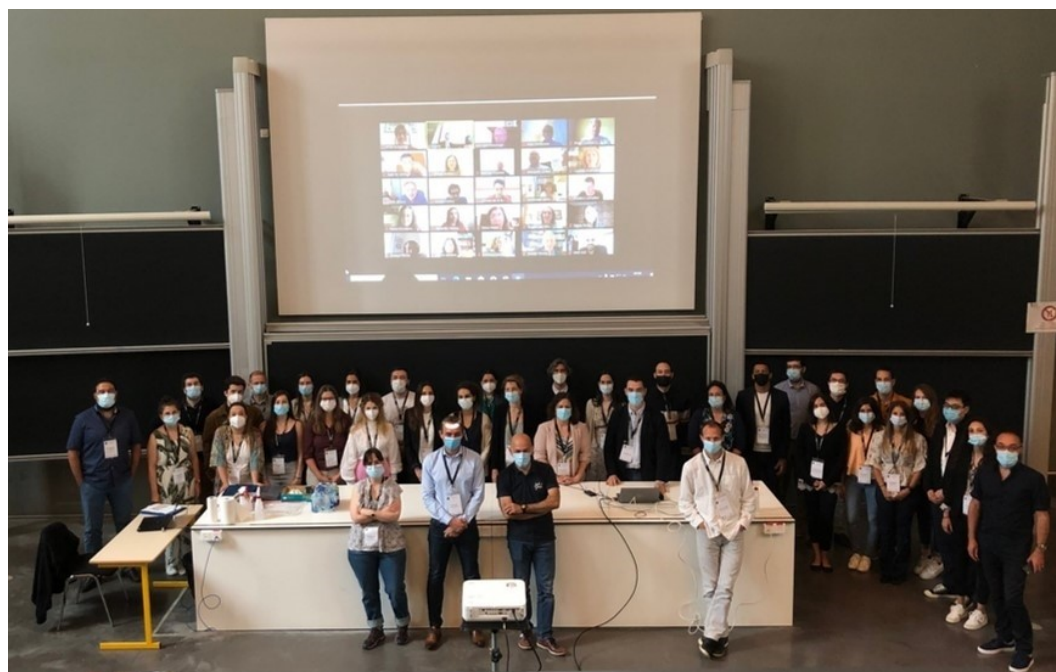
Figure 3. Closing ceremony of the 1st French–Spanish Atelier/Workshop on Electrochemistry with a hybrid configuration, including both face-to-face and virtual participants.

Selected oral and poster communications from the Current Trends of Electrochemistry 2021 meeting were invited to contribute original research or review articles to this Special Collection. It is, therefore, a great pleasure for us, as Guest Editors, to introduce this collection, which contains articles on different aspects of Electrochemistry. These presentations come