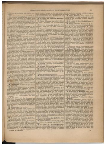
Fig. 1 A page from a parliamentary debate of 26 November 1889 5

The development of an encoding model in TEI for historical proceedings also addresses the need to produce parliamentary data in a machine-readable and interoperable format.