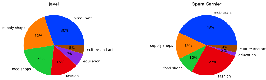
Fig. 1 Composition of two Parisian districts, Javel and Opéra Garnier regarding the amenity categories restaurants (blue), supply shops (orange), food shops (green), fashion (red), education (purple) and culture and arts (brown). We clearly see differences between a more touristic district such as Opéra Garnier and a more residential one like Javel.

Inspired by Knap et al [2] and Paris Mayor policy, we are concentrating on the composition of cities driven by services accessibility in a one kilometer radius (corresponding to a 15min walk at a 5km/h speed).