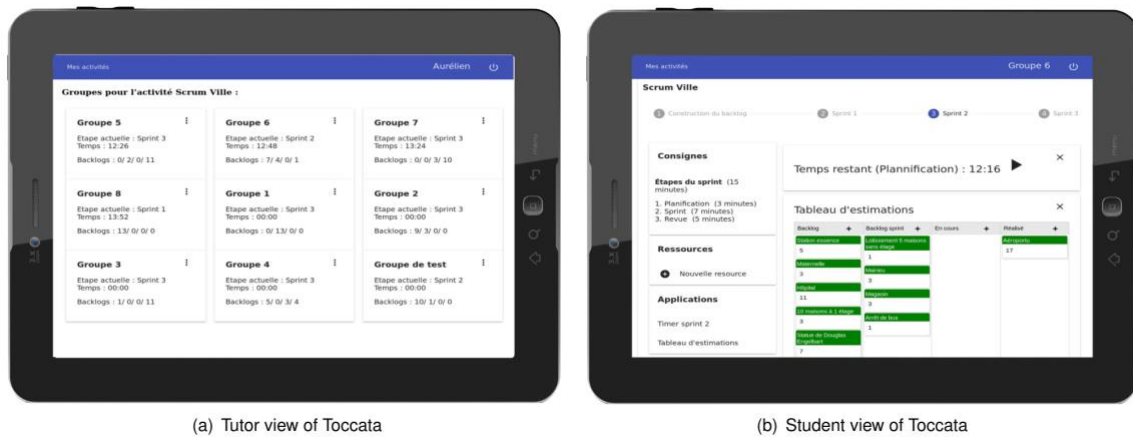
Fig. 2: (a) Tutor view of Toccata when looking at different group progression; (b) Student view of Toccata during an activity with a project management board and timer loaded