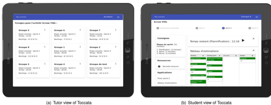
Fig. 2: (a) Tutor view of Toccata when looking at different group progression; (b) Student view of Toccata during an activity with a project management board and timer loaded