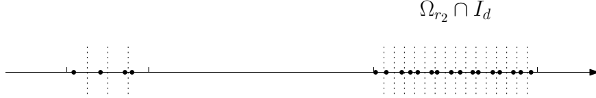
Figure 3: The random set \Omega_{\text{rand,lac}} := \Omega_{r_2} contains almost surely uniformly distributed subset of arbitrarily large cardinal.

In particular, one has \mathbb{P}(B_N) = 1 . □