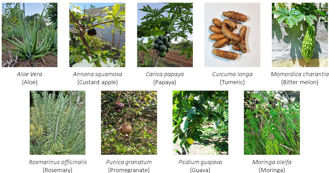
Figure 1. Photographies of selected plants improving the healing of diabetic wounds.