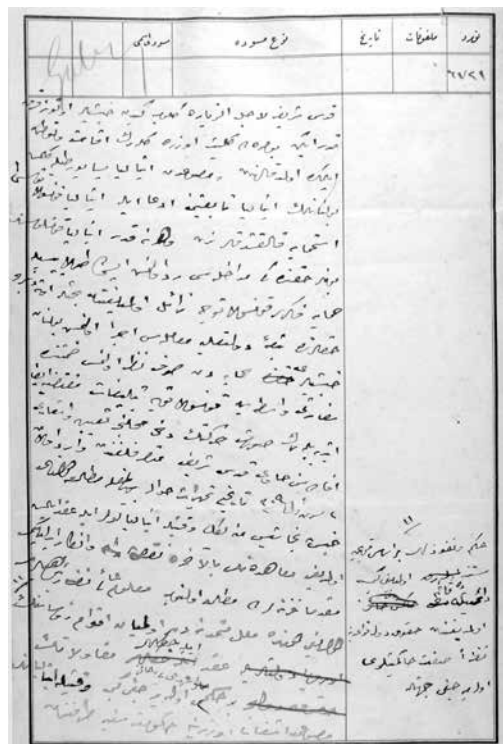
Figure 9. Ottoman foreign office document dated to 1894 stating that numerous Ethiopians in Jerusalem bearing an Italian passport [BOA, code HR.HMS.İŞO.179.19].