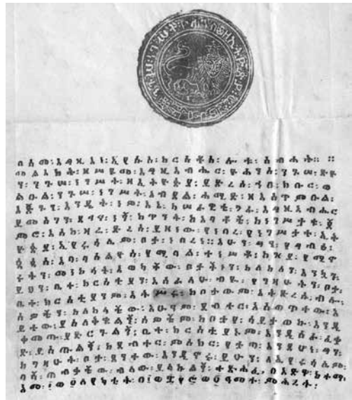
Figure 8. Letter of Yohannes IV to Sultan Abdul-Hameed II dated to 1874 E.C. (1882 AD) [BOA, code Y.A.HUS.170.97].

Documents produced by different Ottoman administrative offices and preserved in the archives of the Ottoman administration itself (that is, outside Yıldız palace) are particularly interesting. These documents open a window onto our understanding of the Ethiopian Orthodox community's relations with the Ottoman administration and its legal status in Jerusalem according to Ottoman officers' points of view. For example, a document from the Ottoman foreign office states that, in 1894, Ottoman authorities were especially concerned to see numerous Ethiopians in Jerusalem bearing an Italian passport (figure 9). 14 Often, different organs of the Ottoman administration were involved in the handling of a single event. For example, in 1904–1905, an Ethiopian delegation led by Däggazmač Mäššäša came to Jerusalem and Istanbul to present claims of the Ethiopian community in Jerusalem and to negotiate a solution. Documents concerning this delegation can be found in archives of the ministry of domestic affairs (DH.MKT.907.10), the foreign office (HR.SYS.412.48), the office of irade /decrees (I.HUS.122.6), and in the correspondence of the grand vizierate (BEO.2552.191354). Thus, a large part of the administrative process of this delegation can be followed.