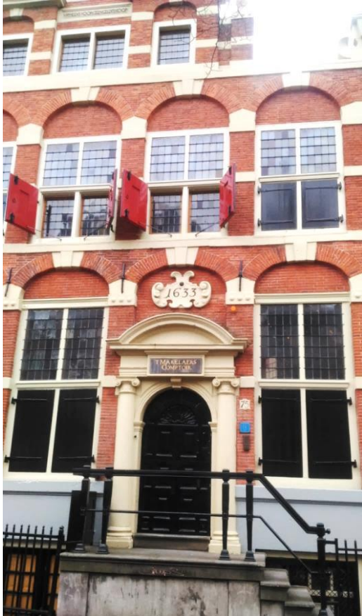
Fig. 1. The Amsterdam brokers' guildhall, built in 1633

Above the door: “t maekelaers comptoir” (“The brokers’ hall”).