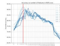
Figure 1: 10 runs of the REFS algorithm, with best answer at 5 taxa (vertical red line).

As shown in Figure 2, the use of ML with REFS give us better results and closer to reality. E.g. the first feature selected was genus Lactobacillus