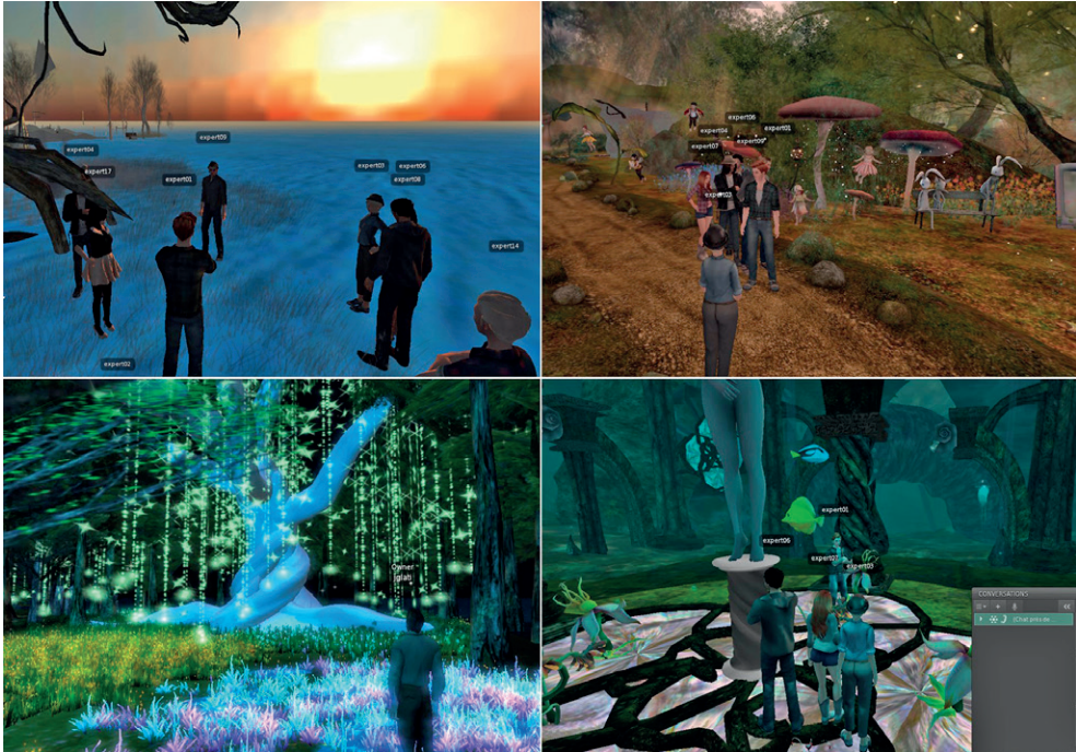
Figure 1. Screenshots of the virtual places used during the workshop and avatars of the participants

The participants were then installed in 3 computer rooms in groups of 6 to 7 participants in order to experience themselves teamwork in virtual environment (avatar manipulation,