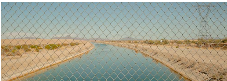
Figure 3: The Central Arizona Project Canal

The Central Arizona Project at 136 miles by car from Phoenix (219 kilometers), Arizona (248 miles, or 400 kilometers from Tucson, Arizona). The total distance of the canal is 336 miles long, or about 540 kilometers.