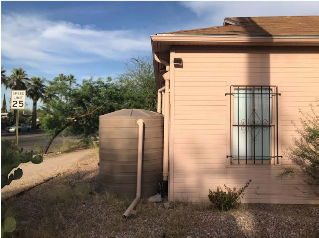
Figure 4: Rainwater Harvesting in a Desert City

Rainwater “harvesting” barrels can be seen throughout the desert city of Tucson, often installed with the help of a rebate program through the city administration that can refund residents up to $2,000. Photo © Anne-lise Boyer, May 2019