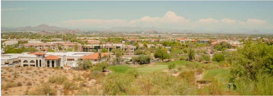
Figure 2: Phoenix – A Desert Oasis

A desert view with a golf course in the foreground to the right, which is a contrast to the semi-arid landscape on the left-hand foreground overlooking Phoenix, Arizona – 12 miles by car (19 kilometers) from the city center. Although it is not universally the case, many golf courses in the desert cities now use reclaimed water to maintain the aesthetic of their grounds.