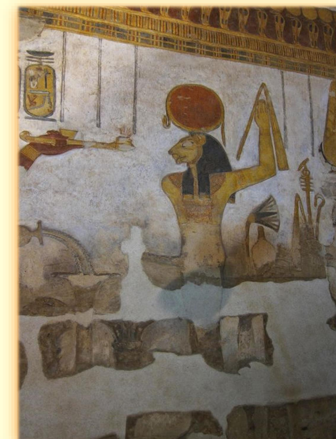
Open source image