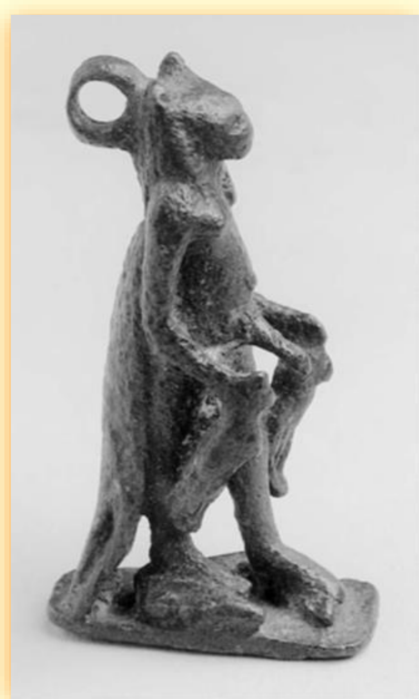
COONEY, 2008, pag. 71