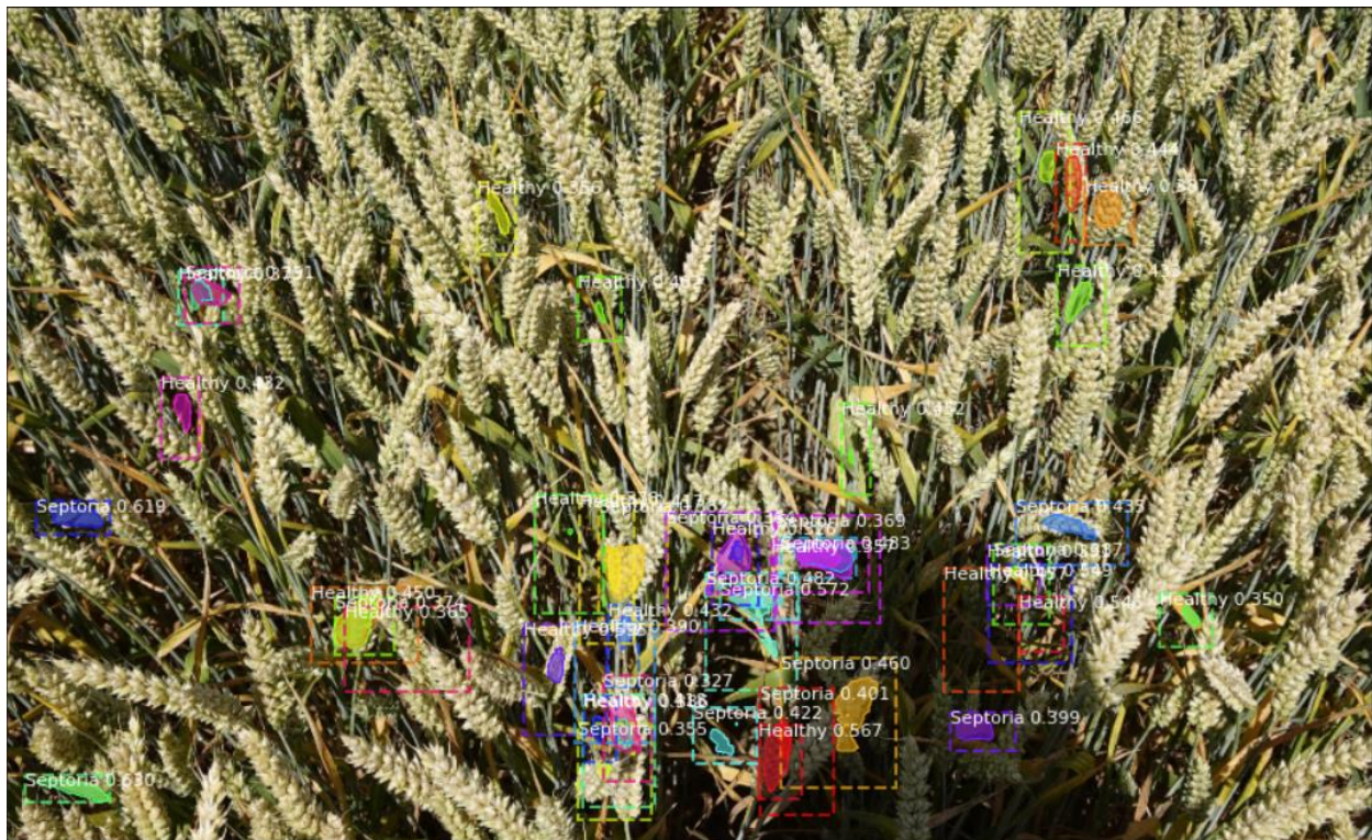
Figure 2: Result of wheat disease detection using the validation dataset with the Mask-RCNN model.

Figure 2 presents the result of wheat diseases detection using Mask-RCNN model. The predictions were performed on validation dataset. The confidence values of detected objects vary between 0.3 and 0.65. The average precisions of the model for each image were relatively low and were between 0.2 to 0.6. In addition, the mean average precision (mAP) is about 0.43.