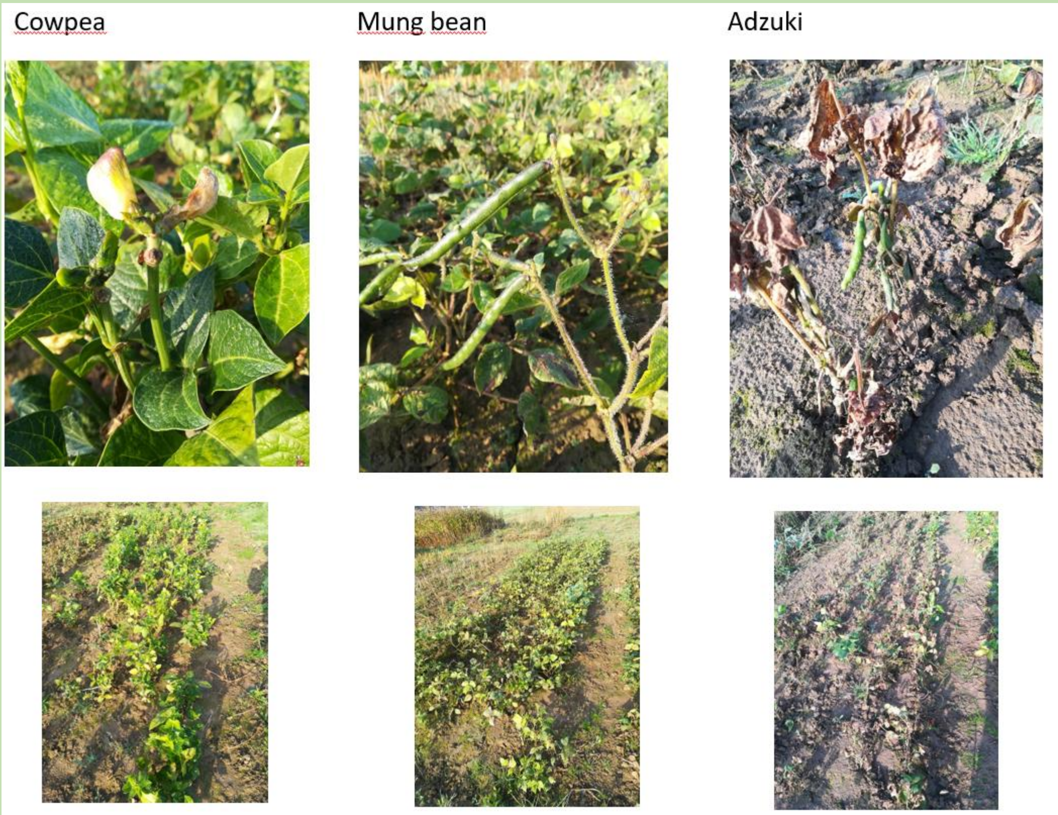
Fig 3. Mung bean, cowpea and adzuki bean the 17 th September 2021 field in Belgium