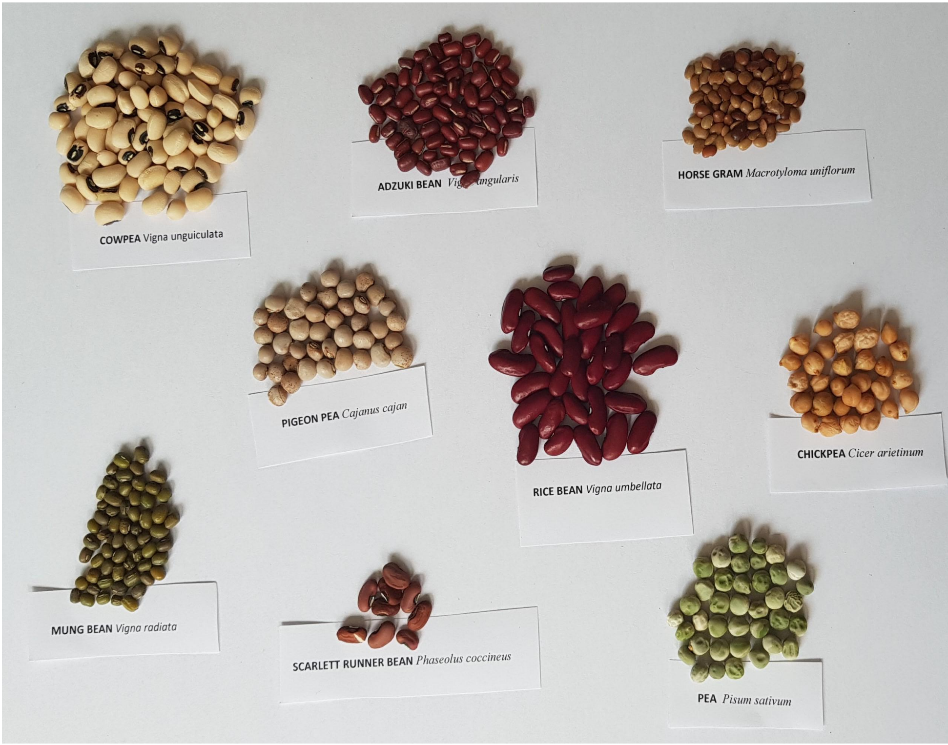
Fig 1 Seeds of minor pulses tested in the study

The 9 minor pulses of the Fig 1 were used for the experiments. Minimal germination temperature was evaluated for 7 days at 6 temperatures: 8°C, 10°C, 12°C, 15°C, 20°C and 25°C. The sum of temperatures necessary to reach harvest was evaluated in three different growing conditions, in two greenhouses (controlled and uncontrolled temperatures) and on field (3 species) in 2021 in Belgium (- 50°29'54.8"N 4°44'28.4"E- 50.498566, 4.741219) sown on June 6 th , following the main growing stages of each specie and recording the yield parameters: number pods, number seeds/pod, seeds weight.