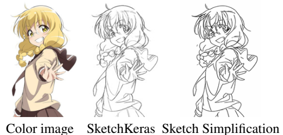
Figure 3. Example of synthetic line art of a color image generate using SketchKeras [14], and Sketch Simplification [21].

Our framework is composed of two main parts: a denoising model \epsilon_\theta from the main denoising pipeline and an application-specific encoder g_\theta for extracting color scribbles information (see Figure 2). The first learns to denoise noisy images from an unknown distribution conditioned to a line art image l . The second part, g_\theta , extracts color features previously inputted by the user to guide the line art colorization. Finally, the predicted image \hat{x}_0 is retrieved using the DDPM sampling algorithm [9].