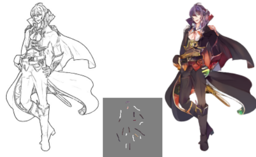
Figure 1. Diffusart enables the colorization of line arts created by an artist l (left) using color scribbles s (center). On the right is the result of our proposal \hat{x}_0 .

In recent years, various methods have explored user-guided automatic line art colorization using deep learning. In particular, Generative Adversarial Network (GANs) architectures have been proposed [3, 20, 26–28]. These methods couple color hints as input with learned color priors from large-scale datasets to colorize the line art images. GAN architectures can achieve impressive and high-quality outputs. However, certain issues remain problematic, for example, ensuring color consistency with user color inputs and reaching color harmony between small image regions. In addition, GAN architectures can be challenging to train due to instabilities [1, 7]. To overcome these issues, Diffu-