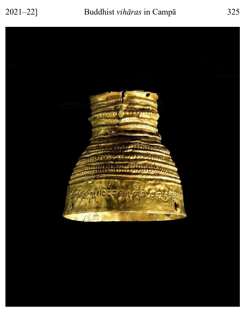
Figure 8. Photograph of the object bearing the inscription C. 247. Collection François Mandeville.