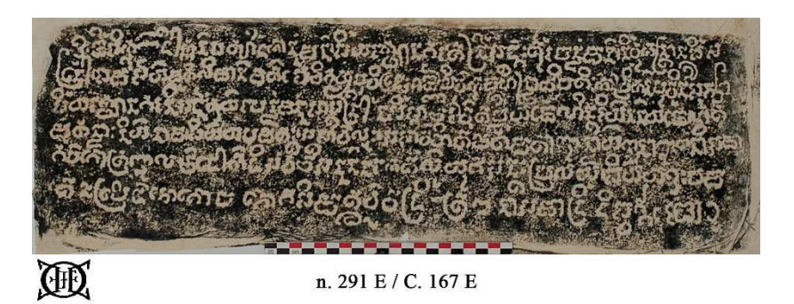
Figure 7. EFEO estampage n. 291 (C. 167, face E).