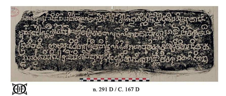
Figure 6. EFEO estampage n. 291 (C. 167, face D).