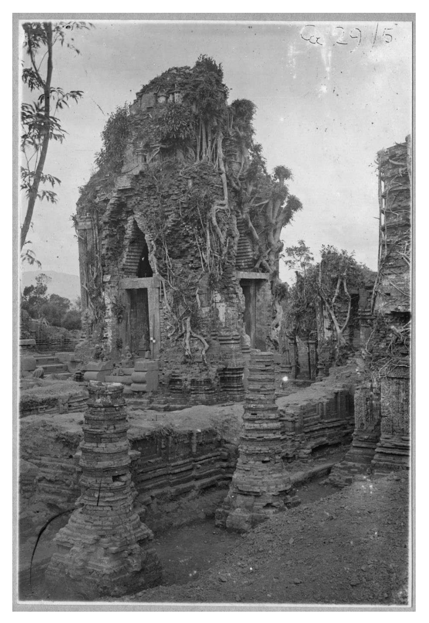
Figure 1. Central tower-shrine and miniature stupas at the site of Dong Duong (viewed from the south-east). EFEO photothèque VIE00197.