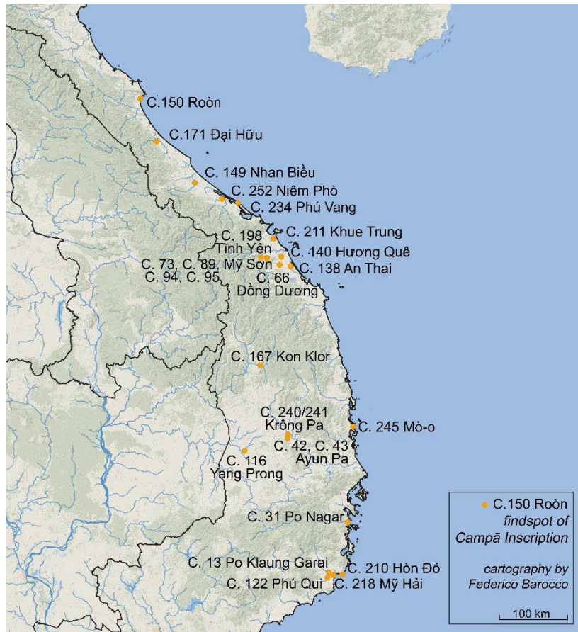
Map: The findspots of the Campā inscriptions mentioned in this study.