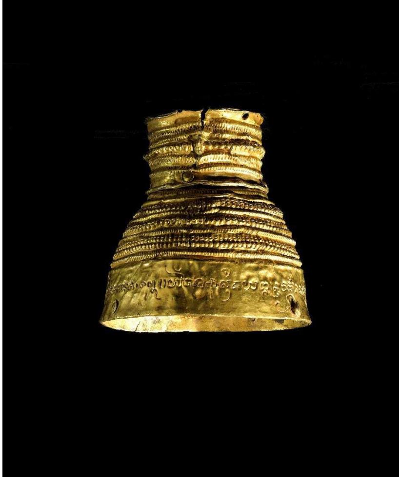
Figure 8. Photograph of the object bearing the inscription C. 247. Collection François Mandeville.