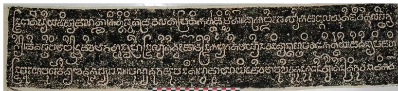
Figure 3. EFEO estampage n. 291 (C. 167, face A).