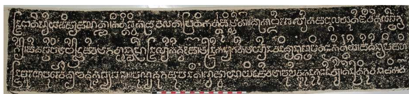
Figure 3. EFEO estampage n. 291 (C. 167, face A).