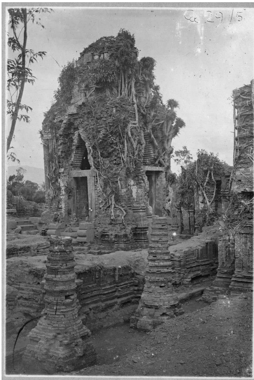
Figure 1. Central tower-shrine and miniature stūpas at the site of Đồng Dương (viewed from the south-east).