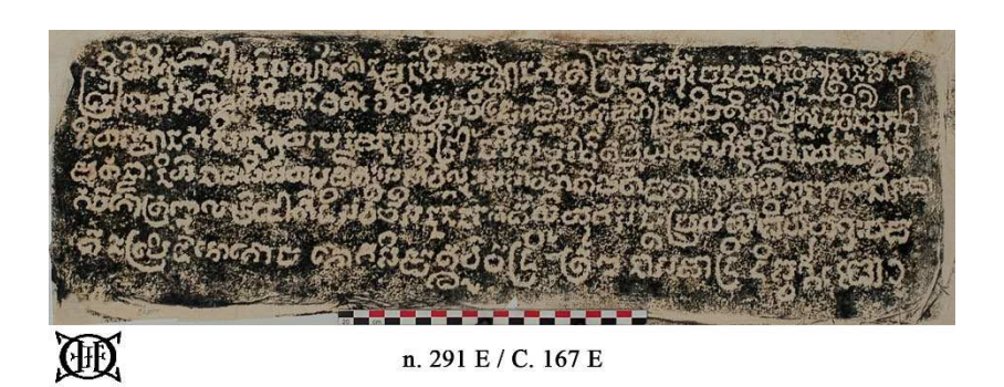
Figure 7. EFEO estampage n. 291 (C. 167, face E).