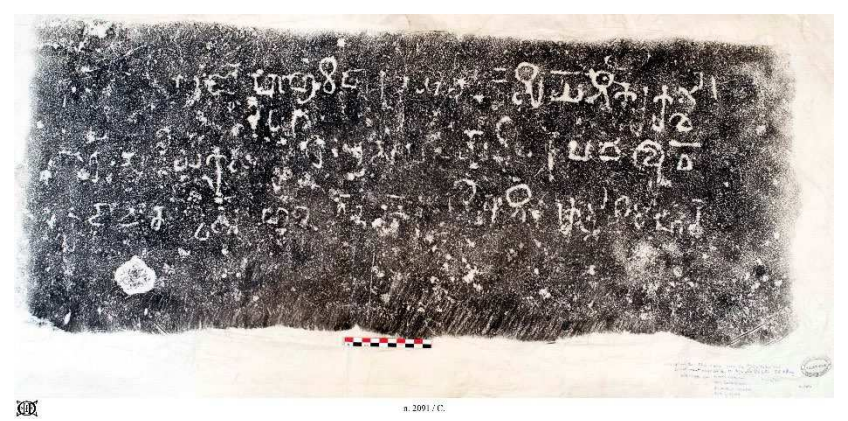
Figure 2. EFEO estampage n. 2091 (C. 234).