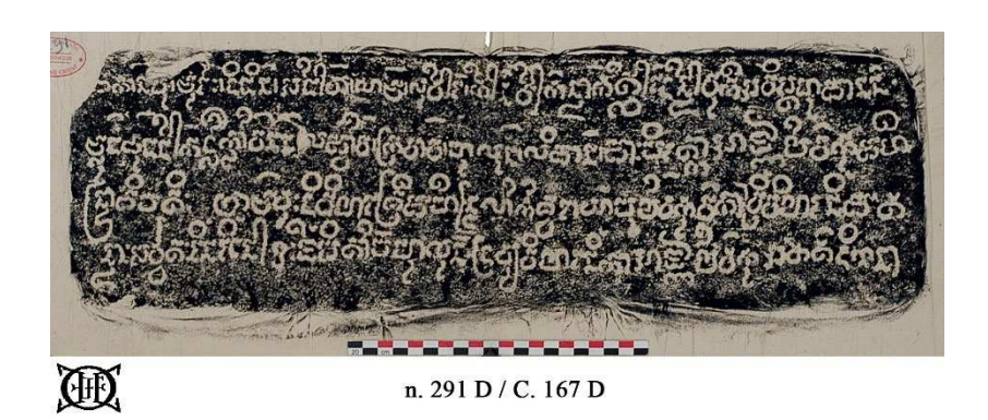
Figure 6. EFEO estampage n. 291 (C. 167, face D).