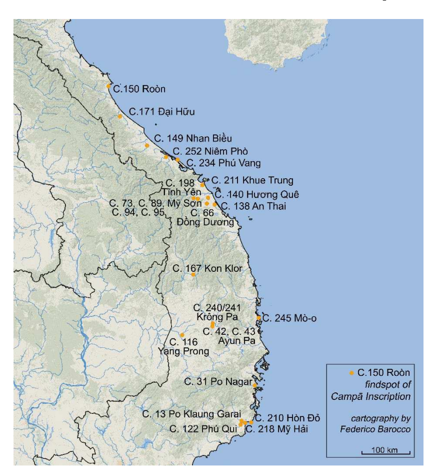
Map: The findspots of the Campā inscriptions mentioned in this study.