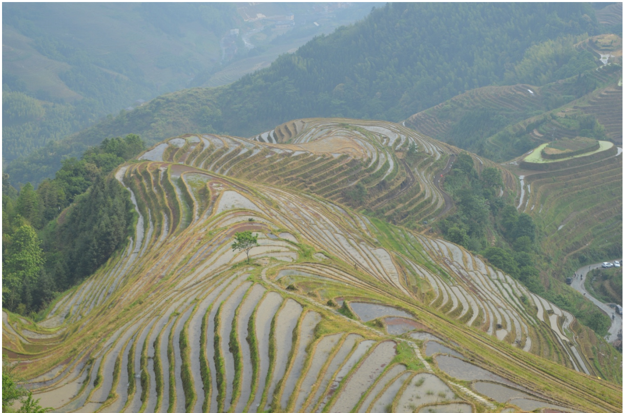
Figure 2. A rice field in China, as an example of sustainable system requiring the governance of the commons, and associated incoherence.

Incoherence, as an effective lever for sustainability, also applies to organizations. Consider the archetype of “the tragedy of the commons”: each individual pursues their own goals in a selfish manner, and in the end, the commons (e.g. in pastoral areas: a shared aquifer, a shared grazing plot or a shared irrigation system (Figure 2) no longer fulfill their function to the detriment of all (15). The principles that prevent the emergence of the tragedy of the commons have been identified by economist Elinor Ostrom and her team, through a global analysis of robust commons over time (16) (Figure 1). Most of these principles are fundamentally incoherent: (i) a commons which primary value could be its openness, instead needs limited access; (ii) the rules to maintain a fragile resource could be strict, but the analysis of robust commons over time shows instead that these rules must be modifiable in a participatory manner; (iii) sanctions, which one might want very strong to limit selfish behavior and fraud, must on the contrary be weak to guarantee the cohesion and belonging of group members; (iv) commons survive if they are managed by a self-organized and autonomous structure, but this structure must be recognized by an external entity in order to be maintained over time. Thus, it appears that incoherence might be a necessary, sometimes counterintuitive, ingredient to correct amplification loops, even in organizations.