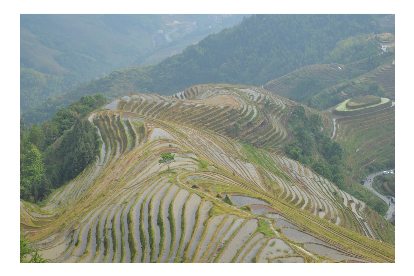
Figure 2. A rice field in China, as an example of sustainable system requiring the governance of the commons, and associated incoherence.

Incoherence, as an effective lever for sustainability, also applies to organizations. Consider the archetype of "the tragedy of the commons": each individual pursues their own goals in a selfish manner, and in the end, the commons (e.g. in pastoral areas: a shared aquifer, a shared grazing plot or a shared irrigation system (Figure 2) no longer fulfill their function to the detriment of all (15). The principles that prevent the emergence of the tragedy of the commons have been identified by economist Elinor Ostrom and her team, through a global analysis of robust commons over time (16) (Figure 1). Most of these principles are fundamentally incoherent: (i) a commons which primary value could be its openness, instead needs limited access; (ii) the rules to maintain a fragile resource could be strict, but the analysis of robust commons over time shows instead that these rules must be modifiable in a participatory manner; (iii) sanctions, which one might want very strong to limit selfish behavior and fraud, must on the contrary be weak to guarantee the cohesion and belonging of group members; (iv) commons survive if they are managed by a self-organized and autonomous structure, but this structure must be recognized by an external entity in order to be maintained over time. Thus, it appears that incoherence might be a necessary, sometimes counterintuitive, ingredient to correct amplification loops, even in organizations.