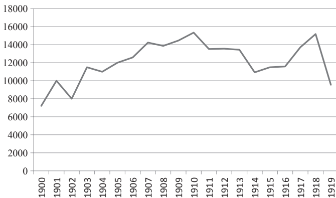
Fig. 10.1 Number of crimes recorded by the Luxembourg Gendarmerie (1900–1919). Source La Gendarmerie au Luxembourg, 1798–1935, Luxembourg, Worré-Mertens, 1935, p. 255

This perception of a growing domestic threat on the part of parliament was based primarily upon a rise in criminality within the Grand Duchy. But these statistics disproportionately emphasised the Luxembourg arrondissement, where 20 of the Gendarmerie 's 33 brigades and 65% of its effective