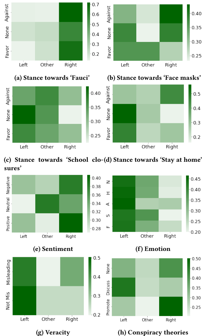
Figure 3: Distribution of the labels for the political bias feature

4.2.3 Political bias feature. Lastly, we analyze correlation between political bias and other textual features, highlighted in Figure 3. We again notice that some topics are controversial, for example, 'Face masks' and 'Stay at home'. In those topics, we see that people against