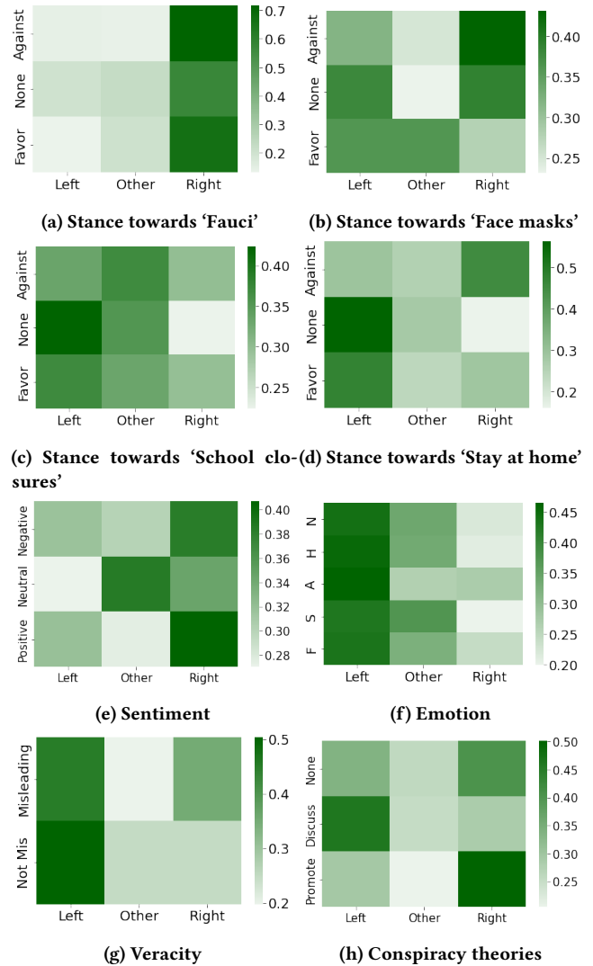
Figure 3: Distribution of the labels for the political bias feature

4.2.3 Political bias feature. Lastly, we analyze correlation between political bias and other textual features, highlighted in Figure 3. We again notice that some topics are controversial, for example, 'Face masks' and 'Stay at home'. In those topics, we see that people against