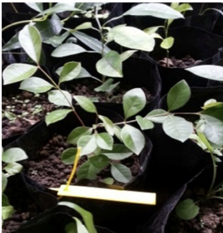
FIGURE 4 | The fruit tree used for object B in the KCK condition.

46 men from 22 to 44 years old, M = 30.6 years old). A summary of the donation design is given in Table 1 below.