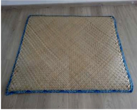
FIGURE 3 | The small braided mat of Pandanus used for object A in the KCK condition.