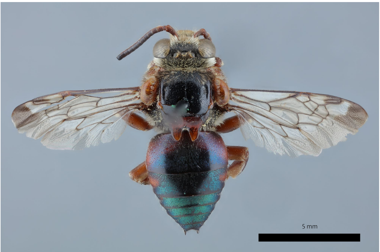
Figure 2. Mesocheira bicolor male (NHMUK 012859028).