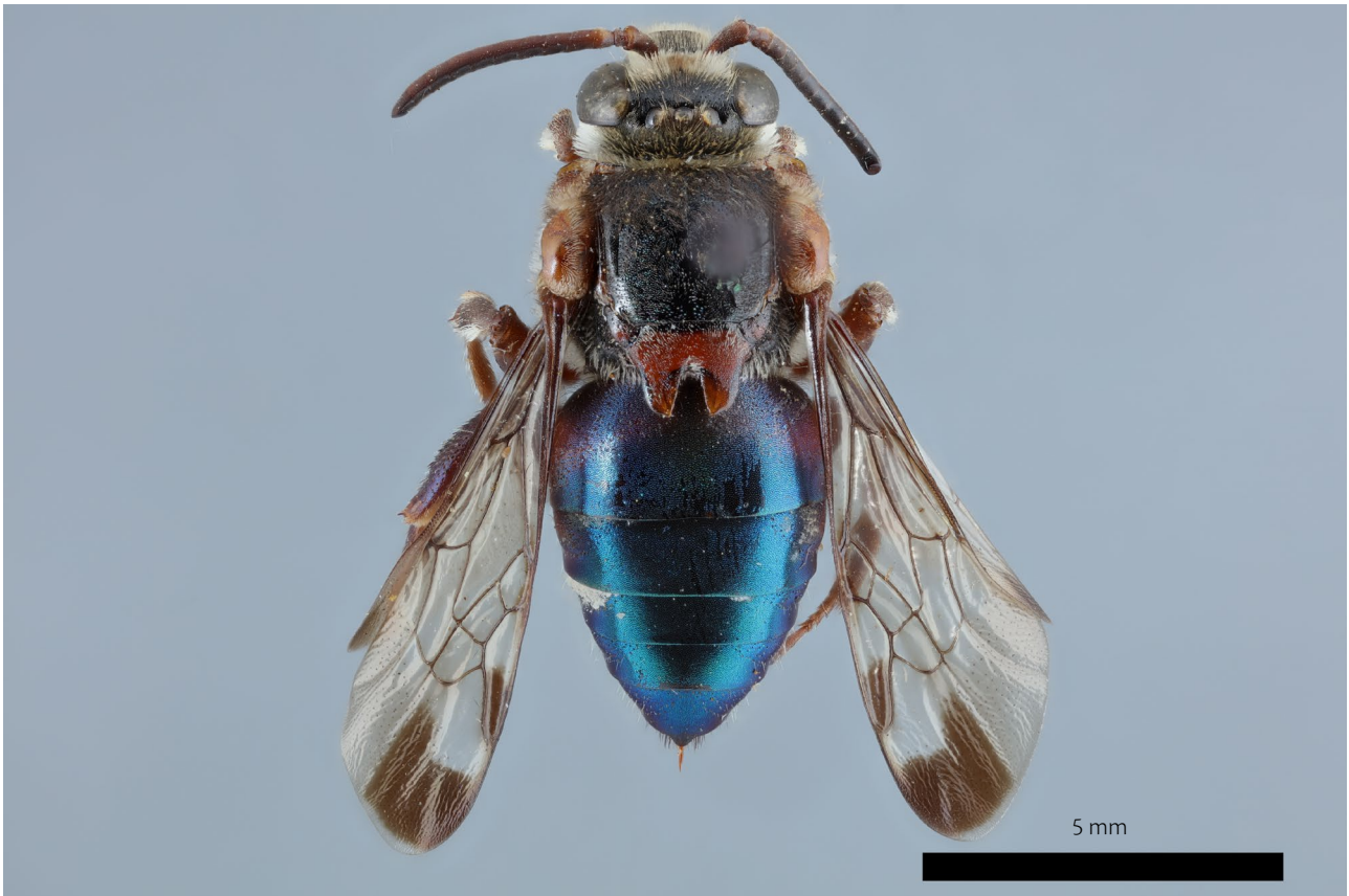
Figure 1. Mesocheira bicolor female (NHMUK 012859027).