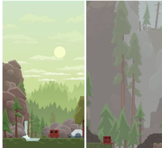
Figure 4: A comparison between the Wii (left) and Flash (right) versions of Super Meat Boy [10].

However, Flash's advantages were eventually outweighed by its disadvantages, including security issues introduced by the plug-in [34]. Additionally, the growing adoption of smartphones, especially Apple's iPhone, which did not support Flash due to closed-source code, high CPU usage, and extensive security issues as cited in their 2010 blog post " Thoughts On Flash " [11], led to its decade long decline. In July 2017, with the Flash install-base representing only a fraction of its peak, Adobe announced the scheduled end of Flash by 2020 [14]. New web standards have since been introduced,