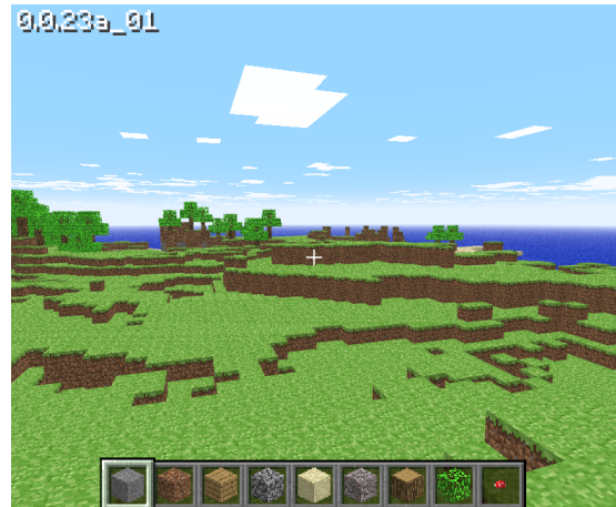
Figure 3: Minecraft Classic in the browser

base. The game allows players to build their own world with almost no limits. Figure 3 shows an example of Minecraft .