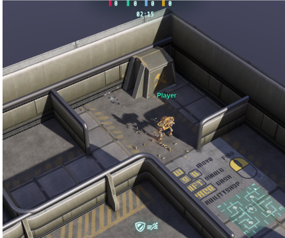
Figure 6: RoboStorm, a WebGL powered browser game.

WebGL-based games. PlayCanvas, 8 for instance, is a popular example and provides a fully capable editor (PlayCanvas Editor) for developing in-game 3D models and interactions. Being fully written in JavaScript, PlayCanvas has the advantage of not requiring compilation, as is often the case with other established game engines that primarily use the C++ language for development. Robostorm, 9 as shown in Figure 6, is an example of a 3D game that was developed with PlayCanvas. It offers online connectivity and advanced 3D graphics directly in the browser.