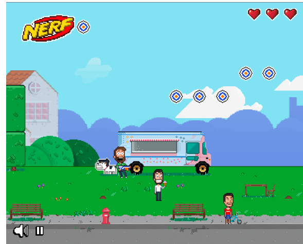
Figure 5: Be A Hero Again, a 2D canvas game developed with Phaser.

It's worth noting that the improvements in graphics and speed due to the HTML5 standards and the arrival of 2D game engines for the canvas element brought browsers closer in line with what was provided by the 2D graphics of the Adobe Flash plug-in years before.