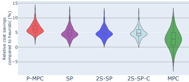
Fig. 2. Relative cost savings from using each of the challenger (SP, 2S-SP, 2S-SP-C) and P-MPC over the heuristic algorithm HEU

We introduce the average performances, both in terms of savings and computation times, of the challengers and baselines across the whole dataset of 61 sites.