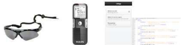
a. Sunglasses camera b. Recorder c. Logging/Tracing tools

In the sequence, participants were asked to think aloud and they received a smartphone (either IOS or Android, accordingly to their familiarity with one of these platforms). They were asked to wear sunglasses with a camera, so that it was possible to determine where they were looking at. Figure 2 illustrates the materials used for collecting user traces during the user testing which included a sunglasses camera, a voice-recorder and a logging tool.