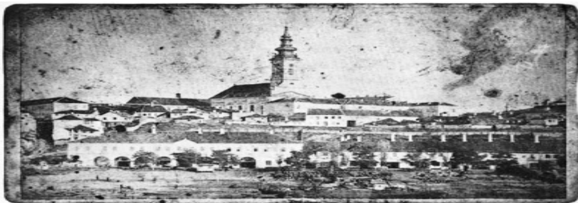
Belgrade panorama 1905.