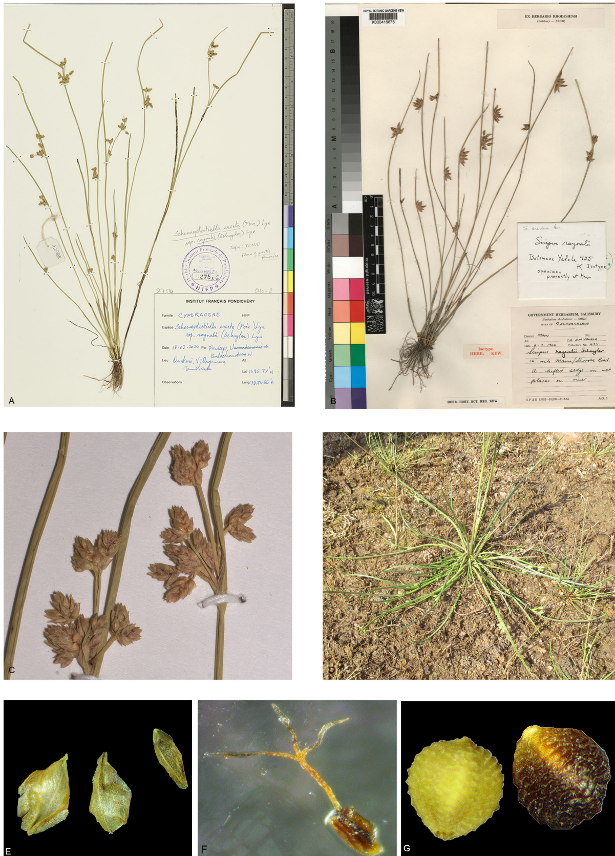
Image 1. Schoenoplectiella erecta subsp. raynalii : A—The present collection | B—Isotype image from KEW | C—inflorescence in close view | D—plant in natural condition | E—dorsal, ventral and lateral view of glumes | F—gynoecium with 3—fid stigma | G—young and matured nutlet.