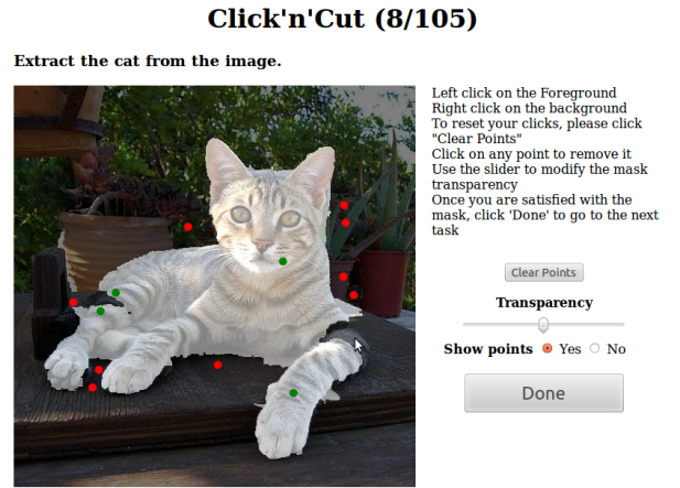
Figure 1: Screenshot of the Click’n’Cut interface.

A worker can also correct a wrong click by just clicking on it again to make it disappear. The Clear points button