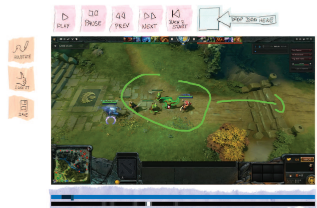
Figure 1: Annotation interface of VideoJot showing a video from the thinking aloud test. Buttons on top of the video allow for navigation while buttons left to the video are used for annotation. Below the video two time lines showing the annotations and the likes are given.

The annotation tool at hand is specifically designed for complex video content with entities and events that are rare,