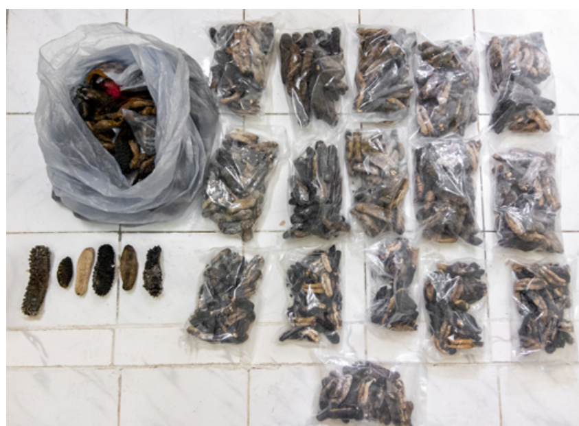
Figure 3. Seizure at the Port Vila airport of sea cucumbers illegally harvested during the fisheries moratorium, and bound for Asia.

These results are truly an encouraging sign in terms of biodiversity and harvest potential, especially in the current context of generalized overfishing of sea cucumbers. This suggests that the current commercial fishing pressure in Vanuatu may be (relatively) low compared to other countries such as the Maldives (Ducarme 2016) or, to a lesser extent, Fiji (Pakoa et al. 2013), and/or that the current updated management framework is working, despite sporadic reports of illegal poaching in Vanuatu (Fig. 3). This contrasts with reports from Kinch et al. (2008), who state that holothurian populations in Vanuatu back then as "depleted around the most populated areas" and then "barely recovered" five years later (Léopold et al. 2013a), suggesting positive effects from latter conservation policies. Whether or not this is sufficient to avoid the classical boom-and-bust cycle and ensure a sustainable exploitation of the resource on the longer term remains uncertain. This is particularly true given 1) the small-scale fragmentation of species distribution, which makes them particularly vulnerable to overharvest; and 2) the adverse effects of an ever-increasing demand for sea cucumber products from the Asian market, including rising fishing pressure and poaching in rural areas.