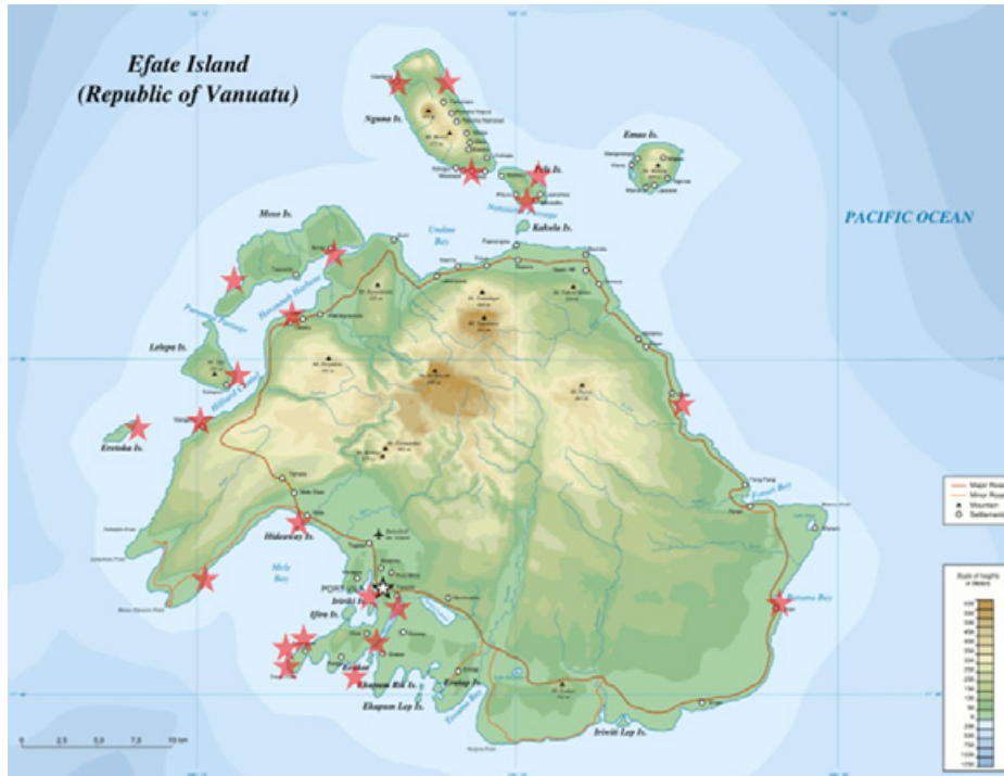
Figure 1. Location of main sampling stations (red stars) around Efate Island.

and identifying and photographing all sea cucumbers encountered. No specimens were sampled for this pilot study.