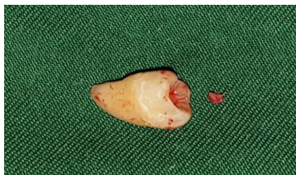
Fig. 4. Tooth after the operation

The left maxillary sinus was thoroughly irrigated with normal saline. The mucoperiosteal flap was repositioned and sutured.