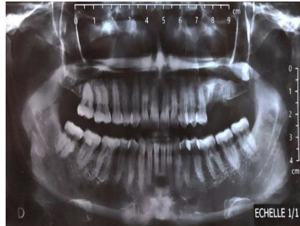
Fig. 1. Preoperative panoramic radiograph of an ectopic eruption of the left maxillary third molar into the left maxillary sinus

the precise site of the third maxillary molar. CBCT showed the ectopic third molar located in the posteroinferior aspect of the sinus deported on the palatal side and in a horizontal position with a close approximation to the lateral wall of the sinus (Fig. 2a, Fig. 2b).