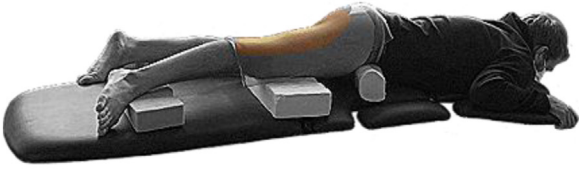
A – BFlh & BFsh