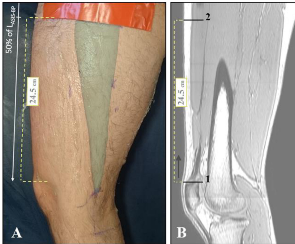
Figure 2. Anatomical landmark used to measure the muscle volume of the gracilis. The anatomical landmark was first determined during the 3-D ultrasound session (A) as 50% of the length between the anterior superior iliac spine and the base of the patella ( L_{ASIS-BP} ). It was transferred to the magnetic resonance imaging scans (B) by identifying (i) the base of the patella, and then by moving up the distance in a straight line to the location of the adhesive strip (ii) where the segmentation could then start proximally.

chosen because it represents a noteworthy and reliable anatomical landmark. On the proximal aspect, we wanted to include intramuscular tendon because this volume is physiologically important and could be used, for instance, for ACL grafts. However, the intramuscular tendon becomes thinner and more difficult to visualize and segment proximally (in both