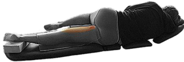
C – GR