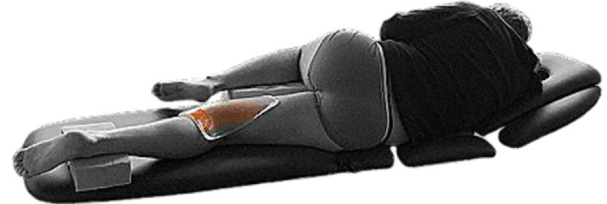
Figure 1. Participants' positions during freehand 3-D ultrasound scanning process using the gel pad. Positions were stabilized by foam supports so that the participants could remain motionless without having to produce muscle tension. (A) Setup used to scan the biceps femoris long (BFlh) and short (BFsh) head muscles. (B) Setup used to scan the semitendinosus (ST) and semimembranosus (SM) muscles. (C) Setup used to scan the gracilis muscle (GR). (D) The same setup was also used to scan the gracilis and semitendinosus tendons with a thinner gel pad. The orange area corresponds to the sweeping area during the measurement.

The distal tendons of the ST and GR are distally located into the pes anserinus (in association with the sartorius). The depth and echogenicity of both tendons change rapidly, and they are difficult to follow distally. Therefore, the 3-D US acquisition was stopped 6 cm under the musculotendinous junction to stop the acquisitions distally. This junction was