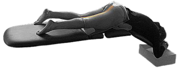
B – ST & SM