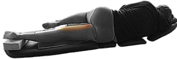
C – GR