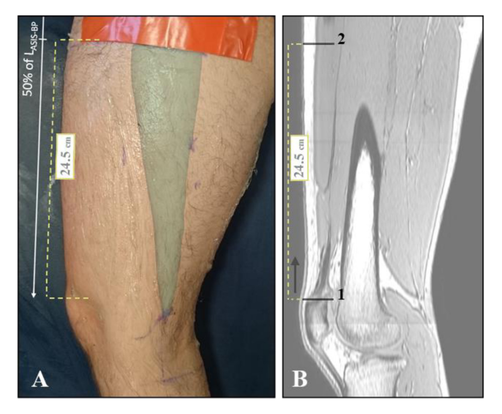
Figure 2. Anatomical landmark used to measure the muscle volume of the gracilis. The anatomical landmark was first determined during the 3-D ultrasound session (A) as 50% of the length between the anterior superior iliac spine and the base of the patella (L<sub>ASIS-BP</sub>). It was transferred to the magnetic resonance imaging scans (B) by identifying (i) the base of the patella, and then by moving up the distance in a straight line to the location of the adhesive strip (ii) where the segmentation could then start proximally.

chosen because it represents a noteworthy and reliable anatomical landmark. On the proximal aspect, we wanted to include intramuscular tendon because this volume is physiologically important and could be used, for instance, for ACL grafts. However, the intramuscular tendon becomes thinner and more difficult to visualize and segment proximally (in both