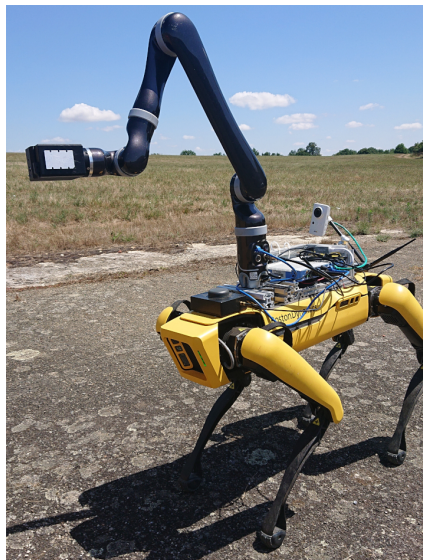
Figure 1: The Spot ® quadruped robot, mounted with extra payload. The controller code was generated from a skillset which was verified a-priori with SkiNet. The skillset in Fig 2 is an extract of the actual running skillset, available at https://gitlab.com/onera-robot-skills/skinet-release .

This section summarizes the elements of a Skillset used for the modelling and programming of autonomous systems, as defined by Albore [1], with some elements omitted as they are not used in this paper. The Skillset can represent both hardware and software elements of the system, and their interaction/execution. A tool called "robot language" generates C++ code based on the skillset specifications that follows this execution, with part of the execution code to be filled by the user, such as skills functions, exit conditions, events triggering, etc. More information on the skillset execution semantic can be found in [1]. A skillset contains resources, resource guards and resource effects. These elements are assembled into skillset transitions, to create events and skills. We define all the elements of a skillset in the following section. An example skillset is given in 2, which was used for generating controller code for the Boston Dynamics Spot ® robot, a quadruped robot capable of carrying heavy payload and perform observation tasks, shown in Fig. 1. This example showcases the syntax of the skillset specification language as it would be written by the user, which is significantly simpler than the underlying formal definition, given in the following section.